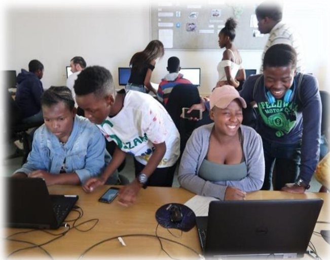
Grade 12s being helped by mentors to do on-line applications to universities