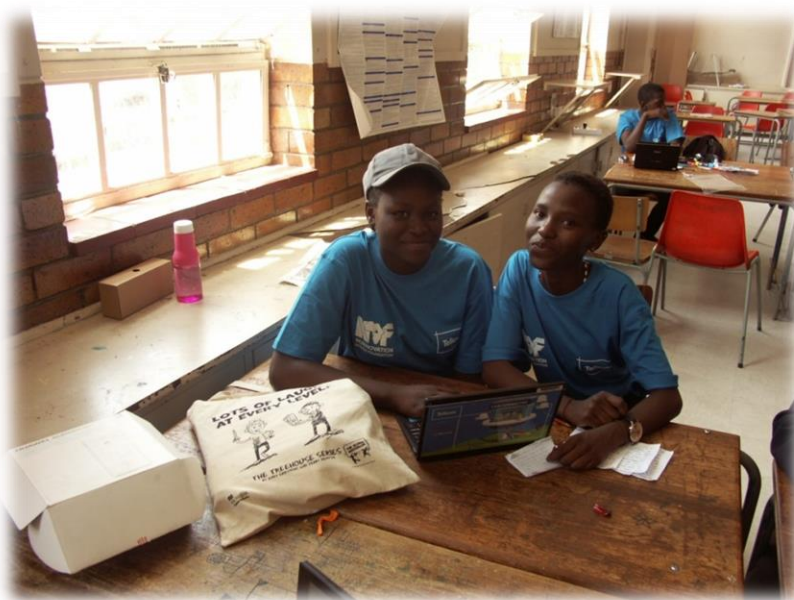
Grade 10s at a coding course organised and sponsored by Telkom and held annually at Waverley Girls' High School