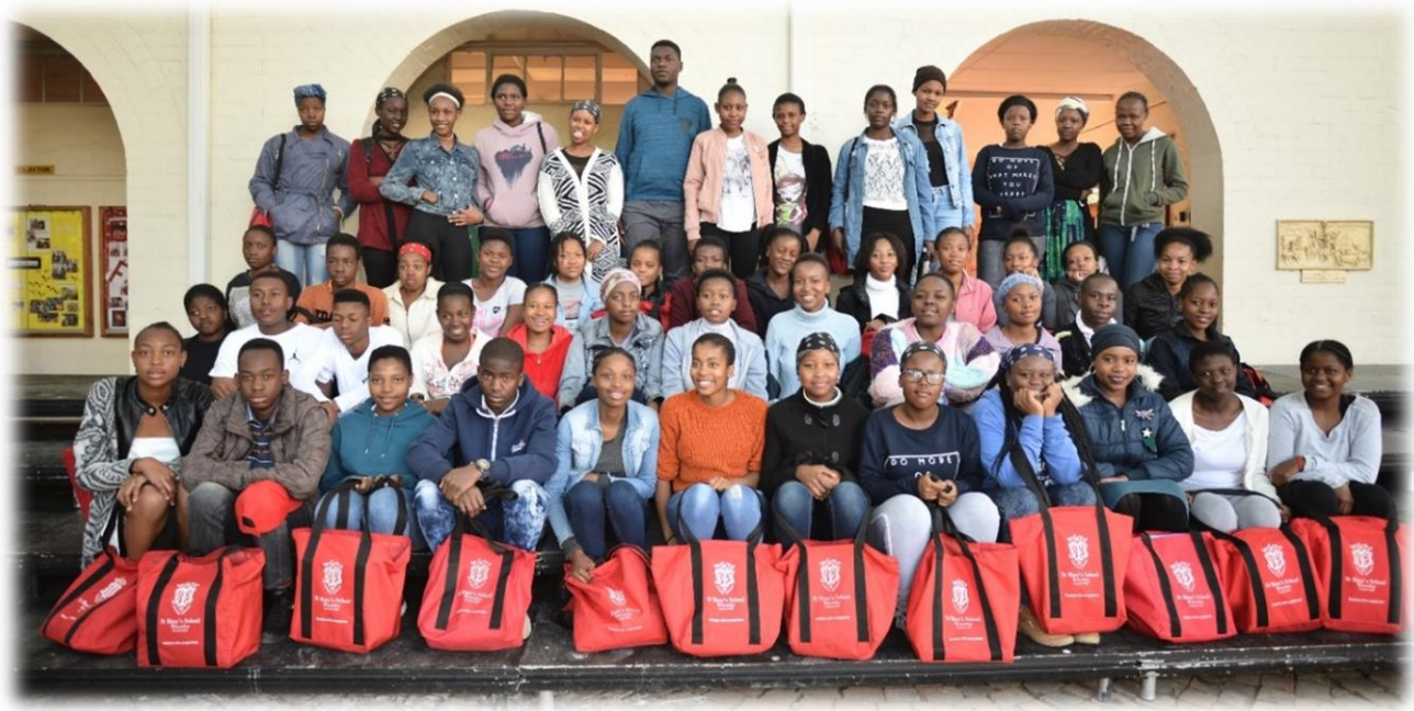
Some of the Grade 11s