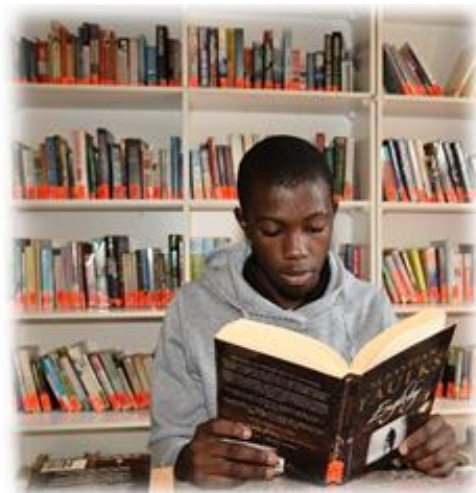
The Ikusasa Lethu library