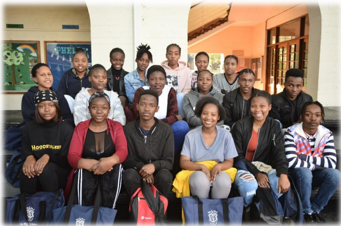
Some of the 2019 Grade 12s

The Grade 12s attended the St Mary's senior play in March. They completed university applications on-line in April and attended the project Talent Show in July.