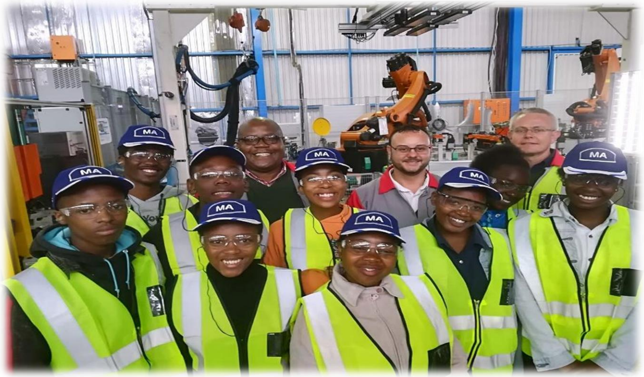
A visit to MA Automotive

“I learnt more about different careers and companies. I learnt about life skills and how I can protect myself myself from early pregnancy.”