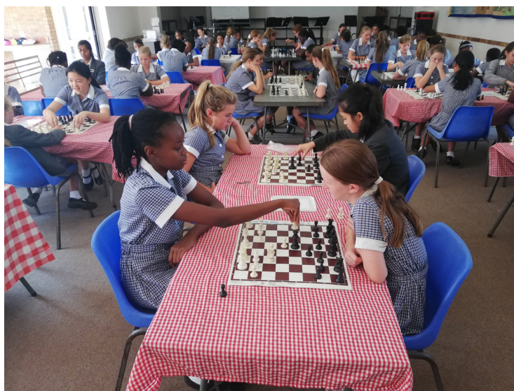
Senior Primary inter-house chess challenge