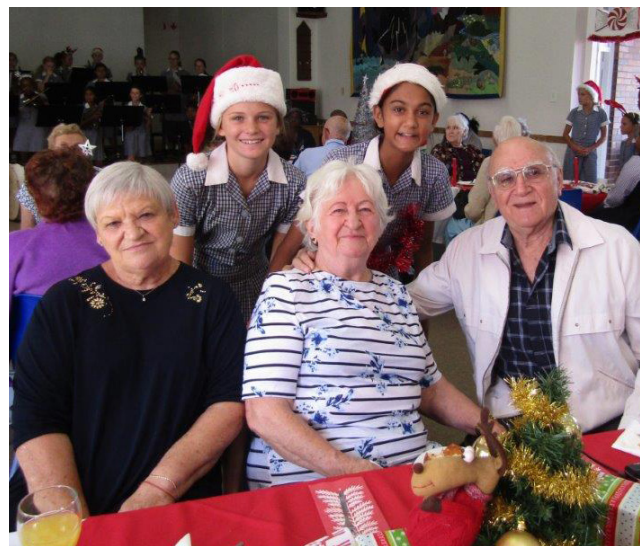
Grade 6 senior citizens tea