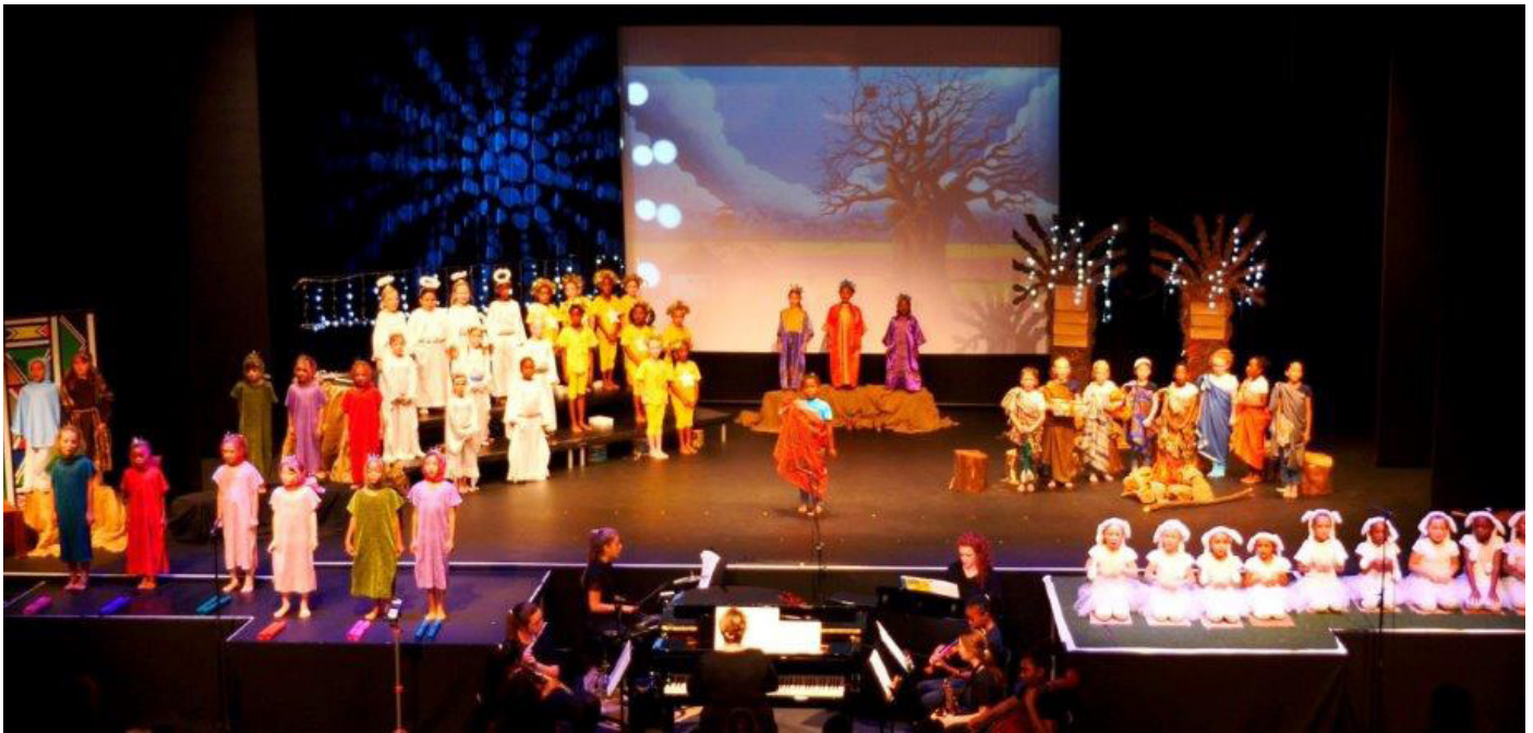
Grade 0 Nativity play

Tel: 011 531 1880 | smjunior@stmary.co.za | www.stmarysschool.co.za