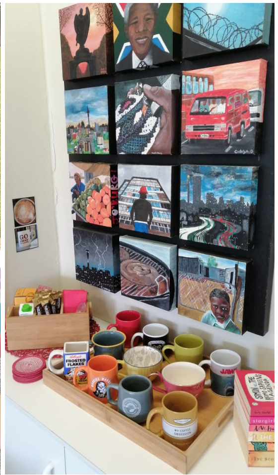
The beverage station

Every year, the Form I classes are presented with a reading challenge to complete by the end of October. The quest includes reading a poem, short story, a prize-winning young-adult title, a graphic novel, a book recommended by someone else and a magazine. To start the year, we explored a diversity of authors with an emphasis on female stories and previously-marginalised voices. The girls were provided with an ever-growing poetry pack and a Kurt Vonnegut Jr short story to add a sweet kiss to Valentine's Day. A library day offered the girls a chance to browse through the teen-fiction prize-winning novels housed in the Wantage centre. The case study on Hergé's Tintin in the Congo , led to thought-