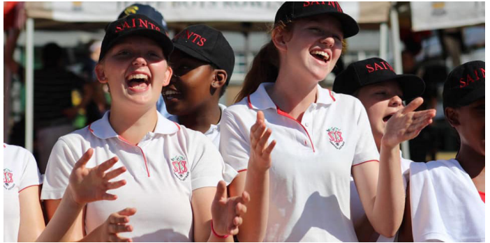
U14 girls in the spirit of racing