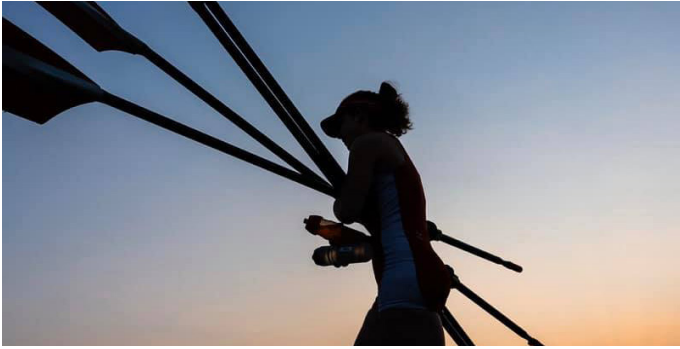
Early morning start