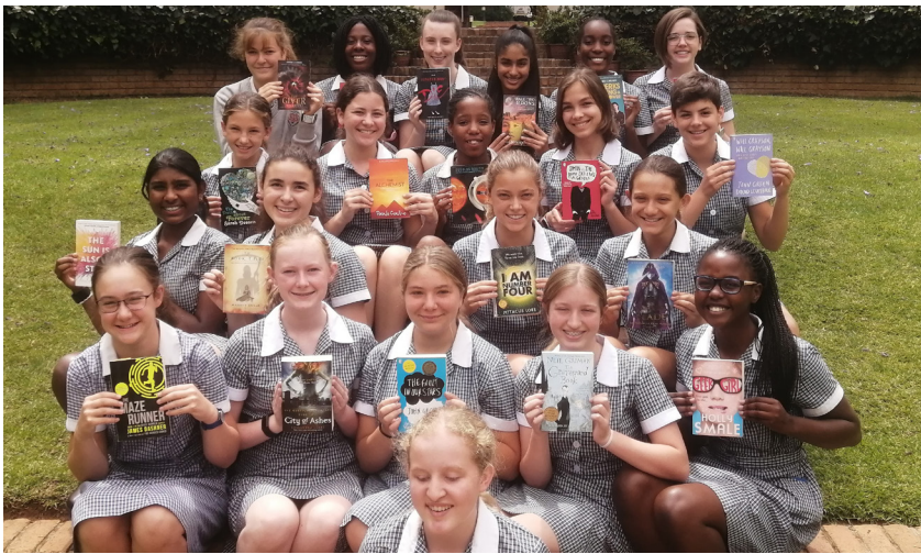
A few of the proud conquerors of the reading challenge