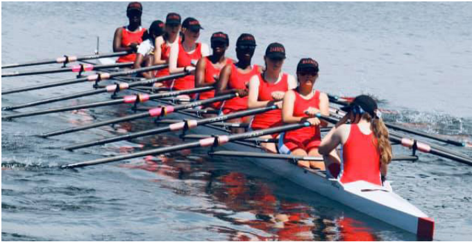
U14 octuple ready to race