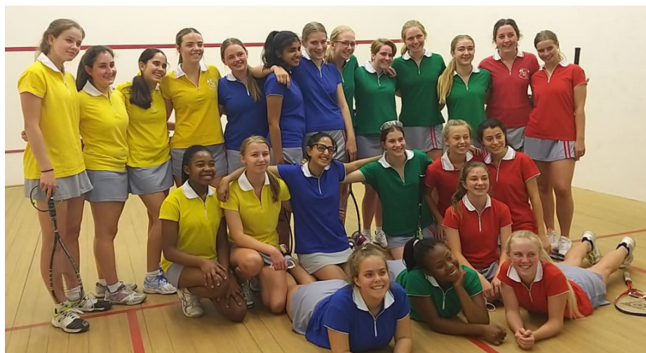
Junior inter-house squash players

Junior inter-house squash took place on 24 October.