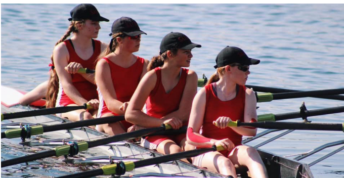
U15 girls preparing for the quad