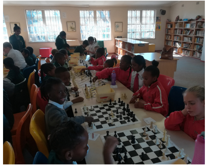
Last term, the Junior chess team (Grades 2 and 3) played a friendly chess match against Fairways Primary School at Fairways