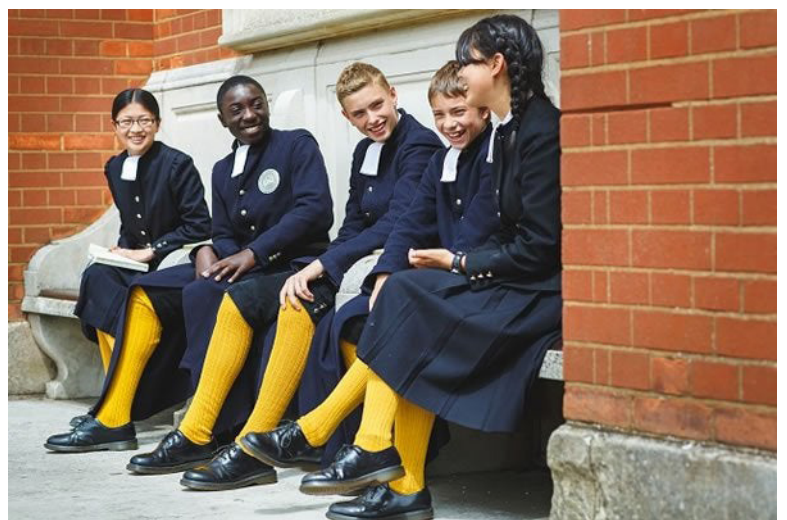
Christ's Hospital school in Horsham, England has a uniform of breeches, knee socks and frock coats that dates back to 1556. The school claims that it is the oldest uniform in existence

So where does this leave us? In the uncertain territory described by perception, half-truth and desire, which means that whatever approach we adopt to the wearing of our uniform will be the result of good-natured, value-based discussion and not a triumph of empirical fact over stubborn tradition that some imagine. School uniforms, by their very nature, are never simply about practicalities. I suggest, therefore, that