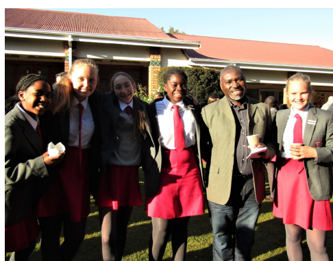
Fathers' Day celebrations took place this week Wednesday and Friday.