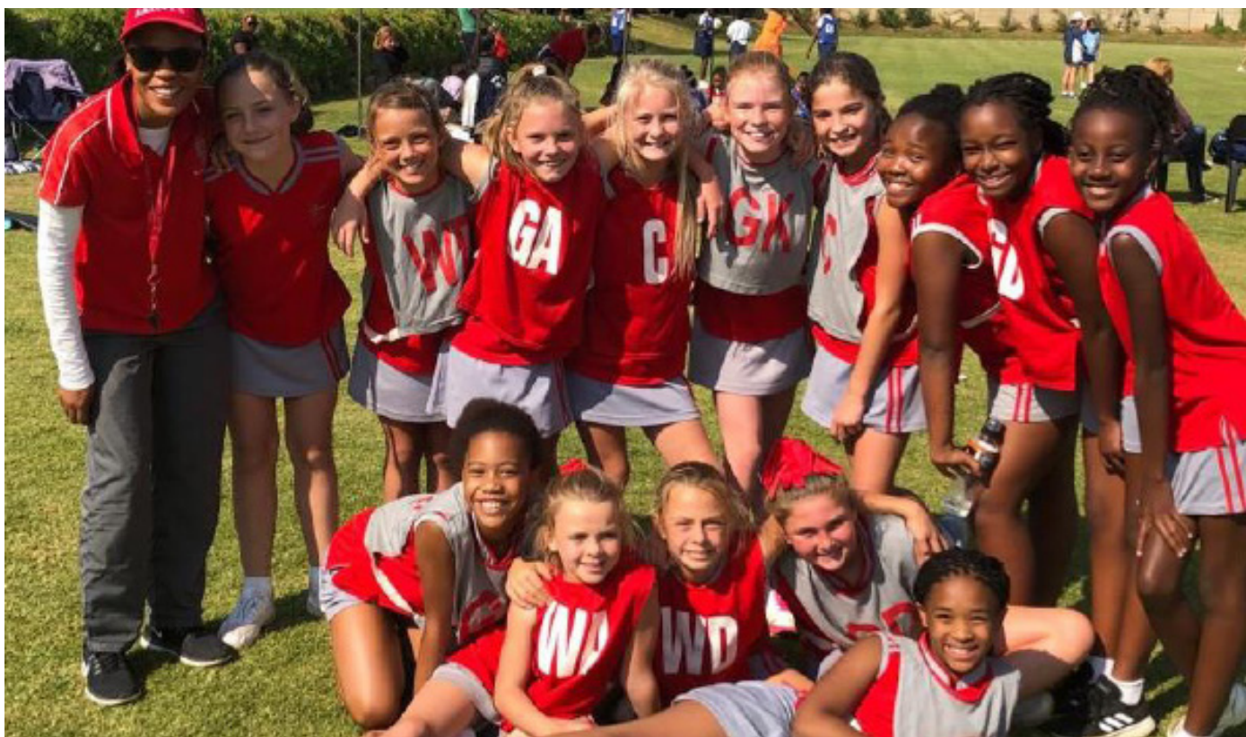
Back row: Grade 5 A and B team at Holy Rosary Netball Festival

On Saturday 25 May, Holy Rosary School once again hosted the Grade 5 to Grade 7 A and B team netball festival. Each team played a varying number of matches. It was an opportunity for the teams to consolidate skills learnt in their weekly practices. The Grade 5 A team won all of their matches. Grade 5 B won three matches and drew two. Grade 6 A won three matches and lost three matches. Grade 6 B won two matches, drew two and lost one match. Grade 7 A won five matches and lost one. Grade 7 B won four matches and lost one.