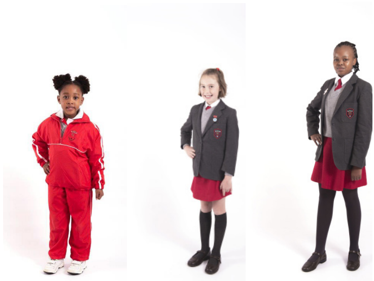
Current school uniform

The issue that excites us as a community is best described as seasonal and relates to the perceived inadequacies of our winter uniform in response to colder temperatures. Again, the evidence that is offered in support of this claim is difficult to verify: some parents insist their children are cold in their uniform, but our observation of girls removing layers of clothing before break and choosing not to wear the school jersey, the thicker tights, gloves and scarves tells a different story. The girls' choice of clothes for a civvies day in the depths of winter is equally instructive; similarly, outfit choices at Little Saints on any day provide food for thought. Children who present with sensory issues account for the unpopularity of certain items – the tights and Grade 0 polo necks spring to mind – while the general distaste for the long grey socks among the older girls, in particular, could justify a lively panel discussion of its own.