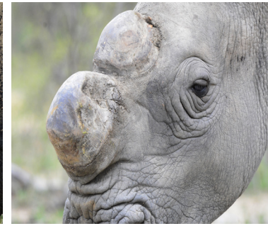
Ferdi the ribbon rhino