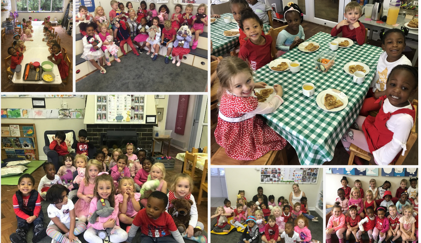
Not even the rain could stop the Little Saints children from celebrating Valentine's Day with a teddy bear picnic. Funds raised will be donated to SPCA Benoni and Teddy Bear Clinic