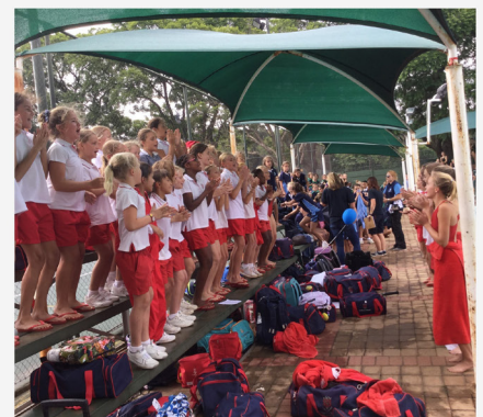
B team gala