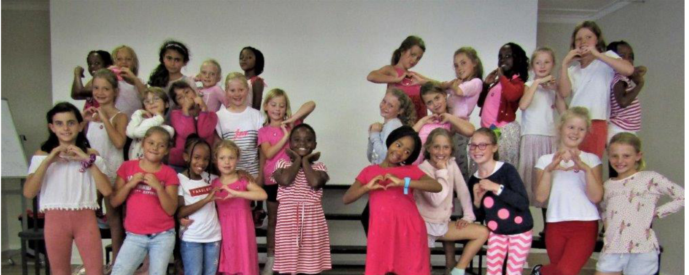
The Grade 3 girls had fun preparing for their Valentine's Day assembly on 14 February. They were able to tell us many interesting facts about the heart as well as reminding us all of the importance of showing love towards others