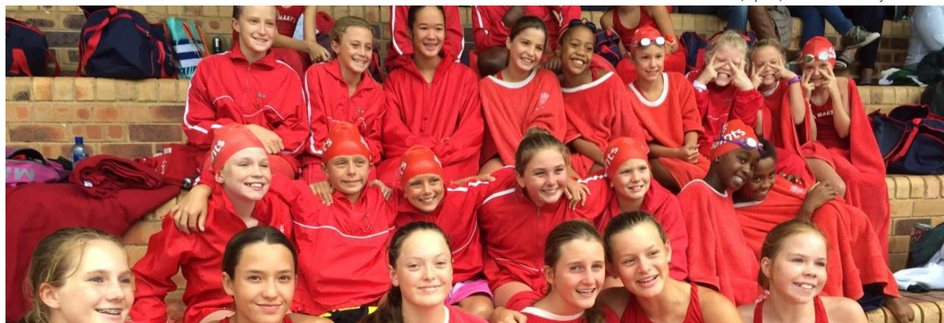
The A team at the St Stithians night gala