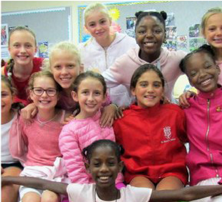
Junior School civvies Valentine's Day; funds raised will be donated to SPCA Benoni and Teddy Bear Clinic