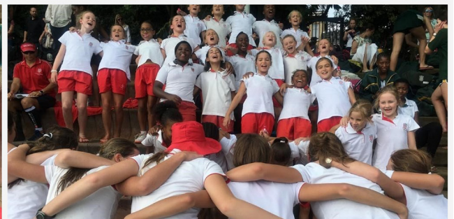
A team gala