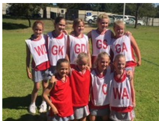
Grade 4 girls at St Peter's Girls' Prep

Well done to all the players who participated and made St Mary's proud with their enthusiasm on the netball courts.