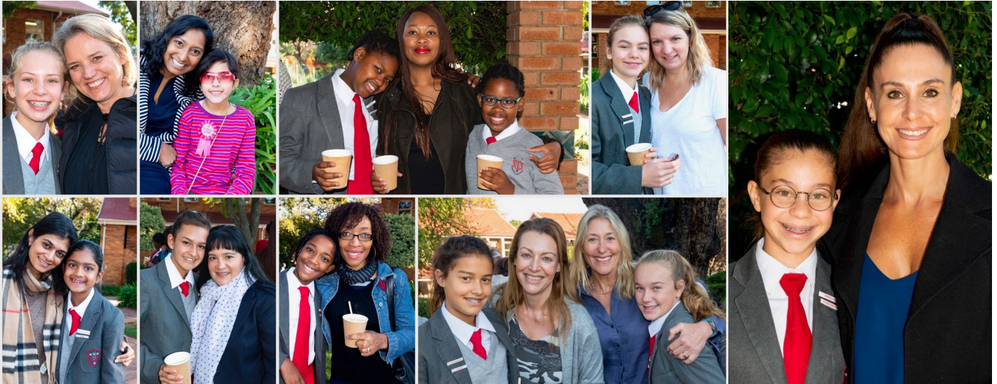
The Mothers' Day service was well attended and the girls loved having their moms with them