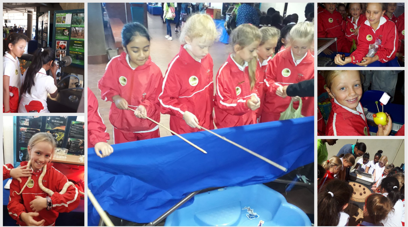
The Grade 3 girls went on an exciting outing to the Yebo Gogga exhibition where they learnt about creatures such as rats, mosquitoes, hedgehogs and snakes. The girls had an opportunity to hold these animals and they discovered new and interesting facts about our world. Fun was had by all!