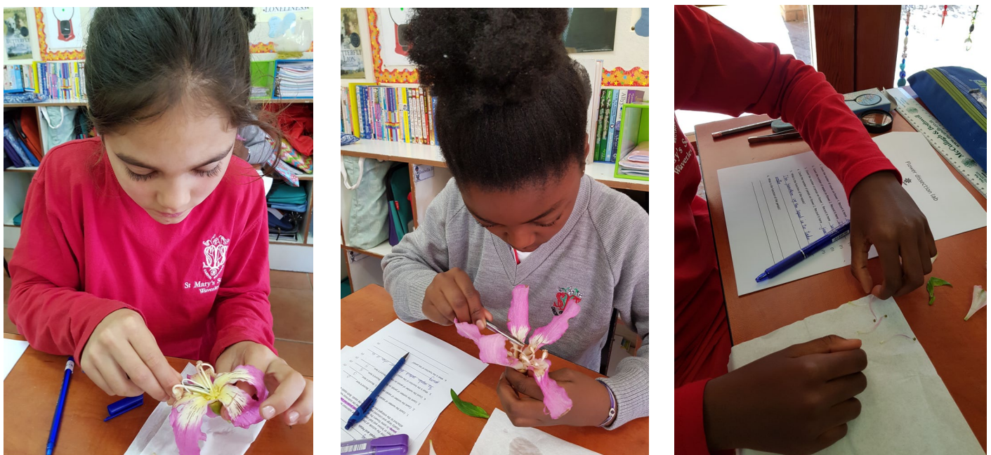
The Grade 5s are learning about flowers, pollination and seed dispersal. They enjoyed completing a flower dissection lab this week.