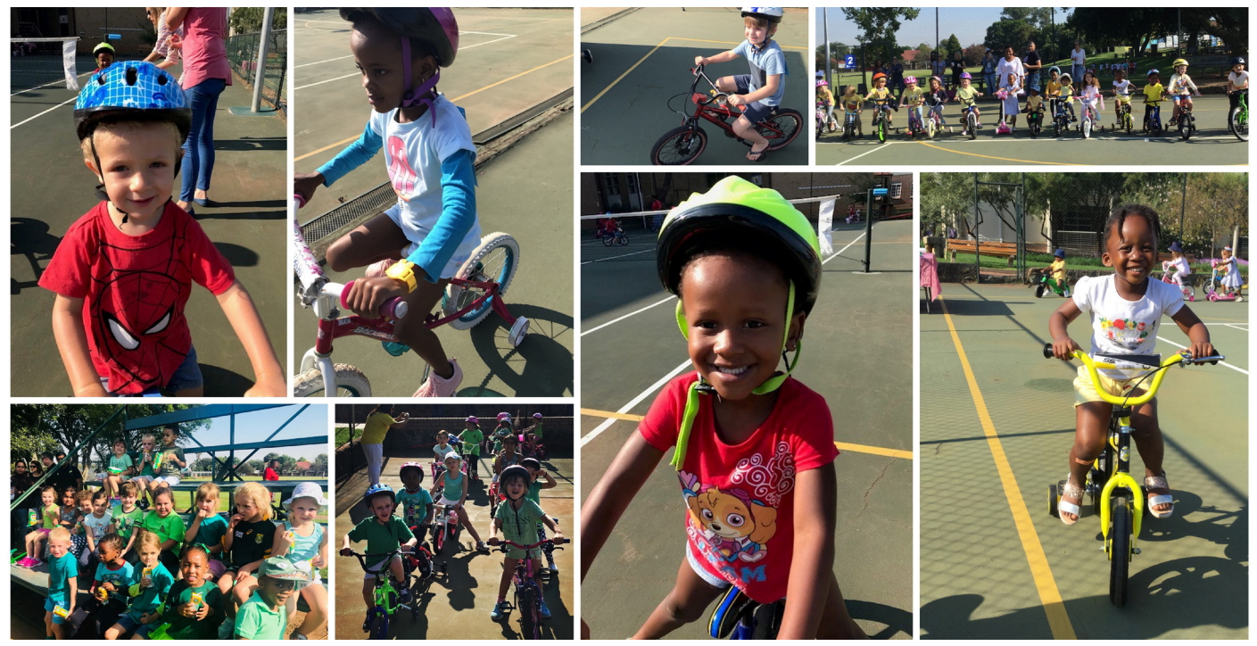
Our annual fundraiser, the Little Saints and Grade 0 wheelathon was a huge success. The children thoroughly enjoyed zooming around the tennis courts on their bikes and scooters