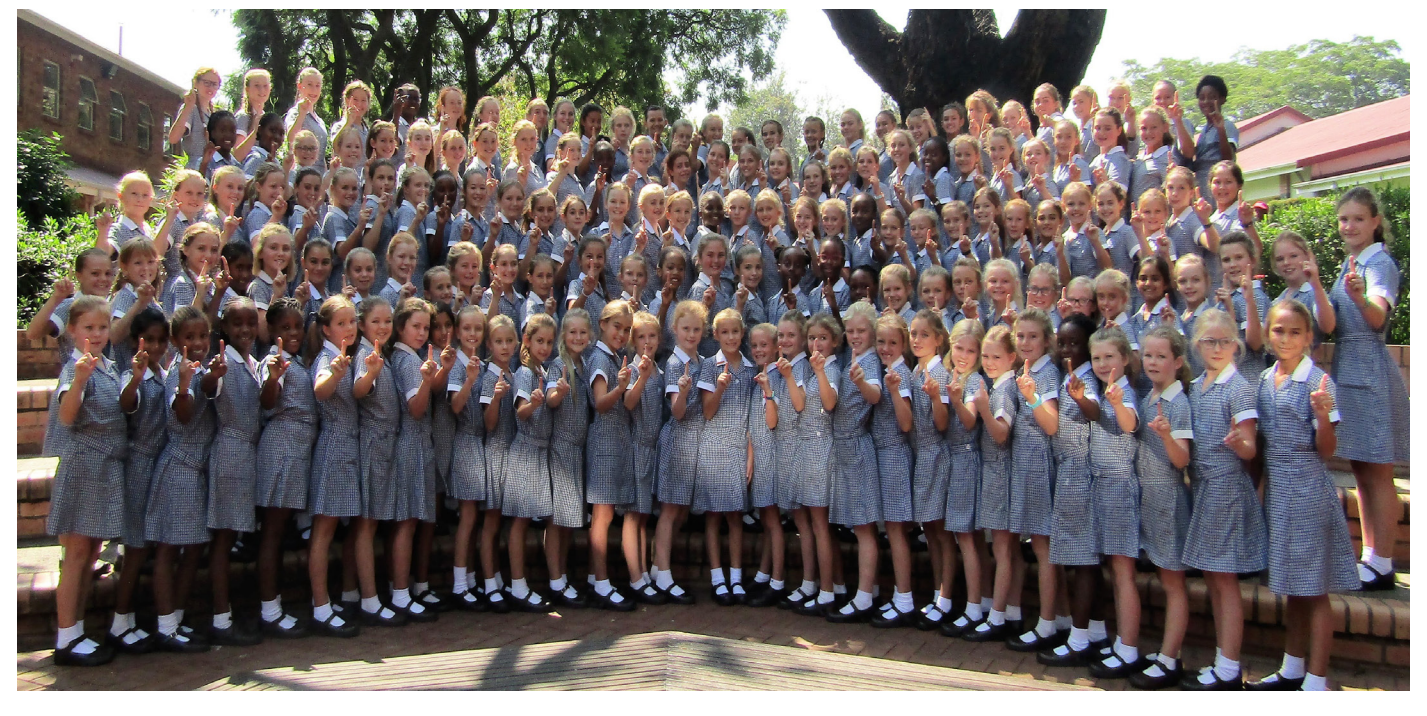
Winners of the A, B and C Prestige galas