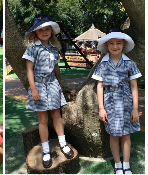
First day in Grade 000, Grade 0 and Grade 1