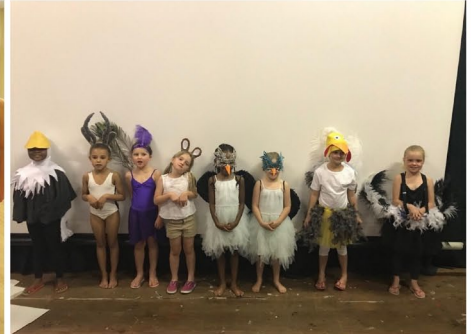
The dance and drama project offers Royal Academy of Dance ballet training, Dance Mouse/Madness (modern styles) and Drama to the Junior School