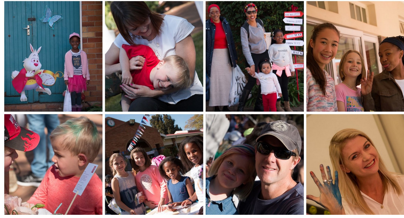
The PTA fun day last Saturday was a huge success, enjoyed by all