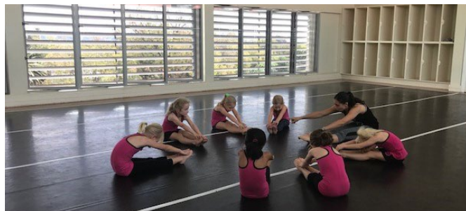
Grade 0 Dance Mouse

Our Dance Mouse (Grades 0 to 3) and Dance Madness (Grades 4 to 7) girls will be performing at the annual Dance Mouse Festival at the Rivonia Barnyard in October, affording the girls an opportunity to perform outside the school in a competitive environment alongside about 800 other dancers from across three other franchises of Dance Mouse.