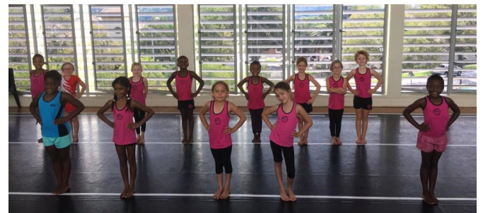
Grade 1 and 2 Dance Mouse