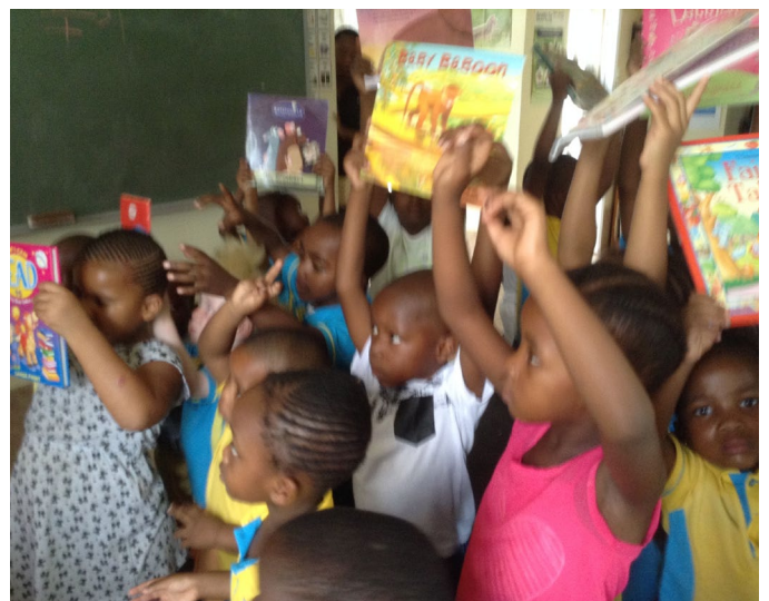
Some of the Easter eggs and books collected in the Junior School were donated to nursery schools in our community and surroundings