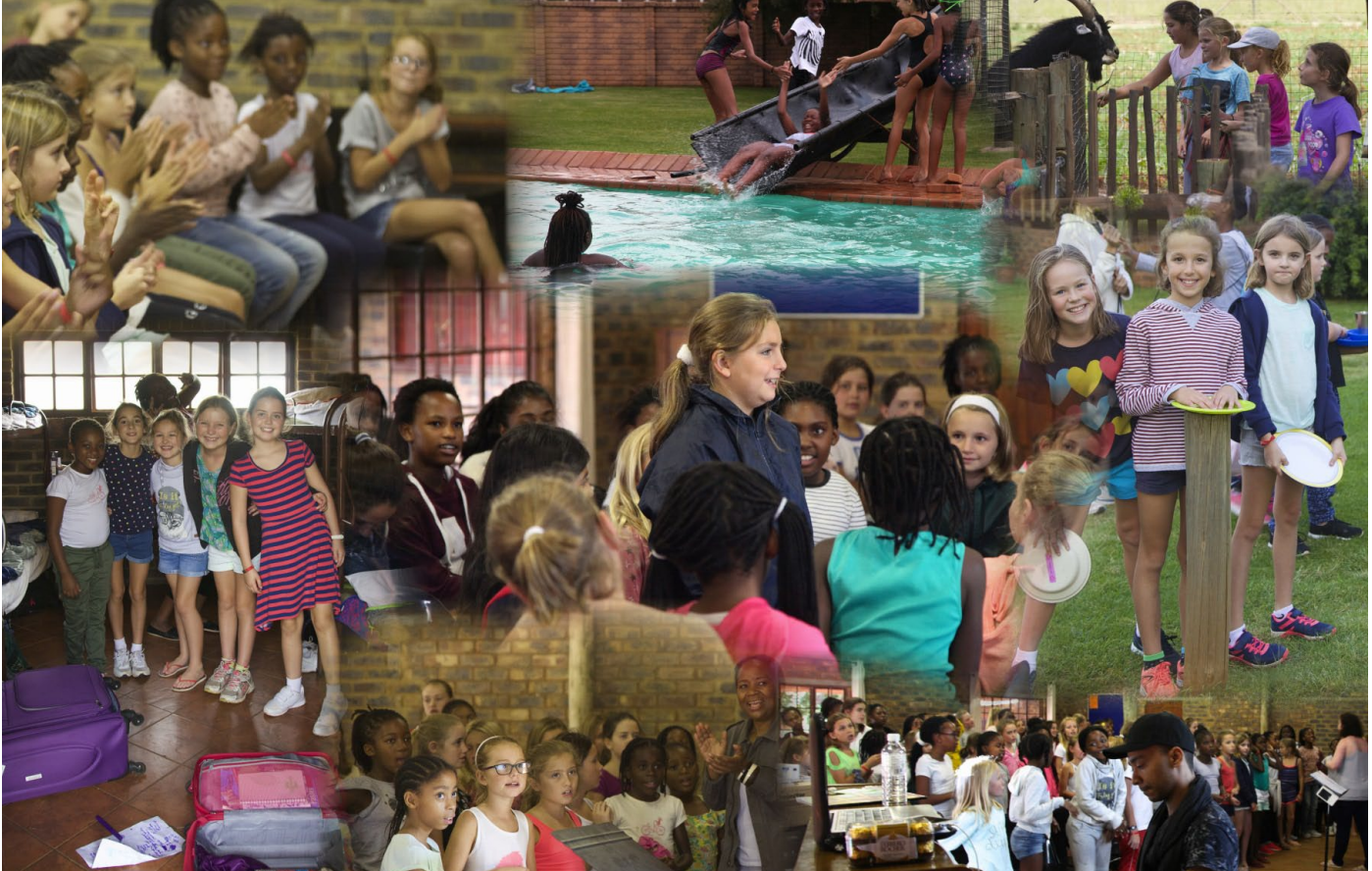
Choir camp highlights