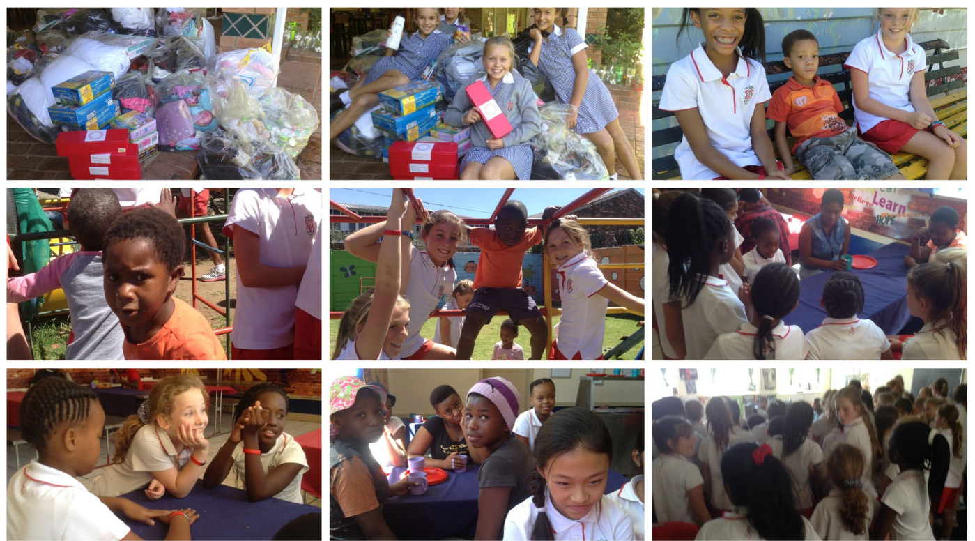
The Grade 5s visited Kids Haven