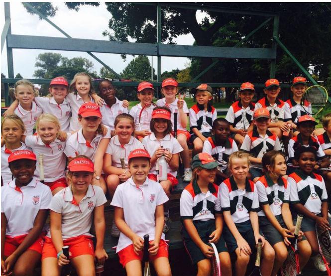
Grade 3 friendly match against the players from Beaulieu