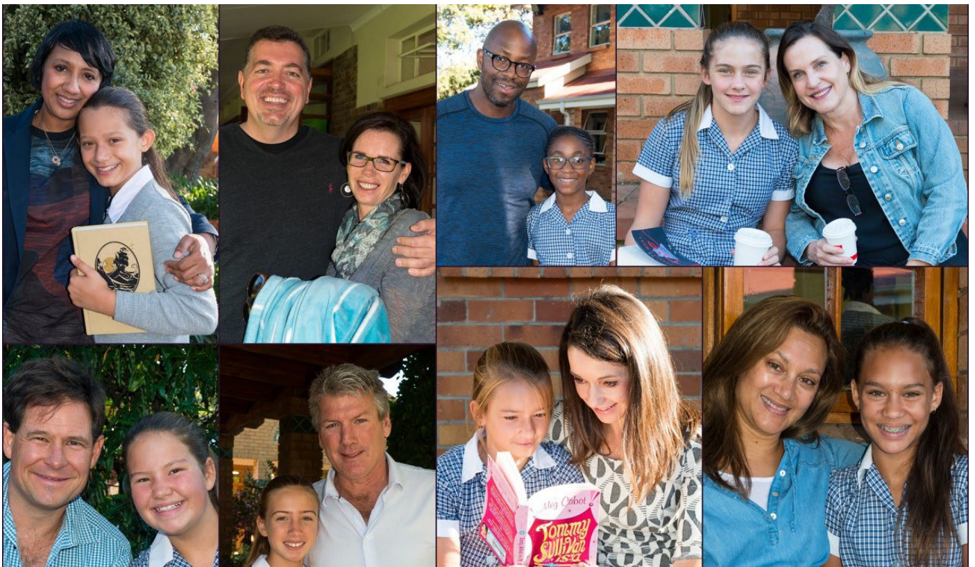
Last Friday, Senior Primary parents were invited to spend time reading with their daughters; a special and beneficial time spent together