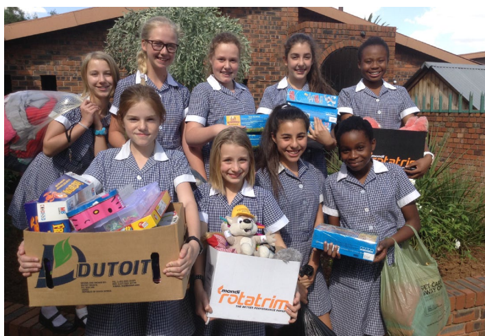
The Grade 7s visited the Maria Kloppers Children's Home