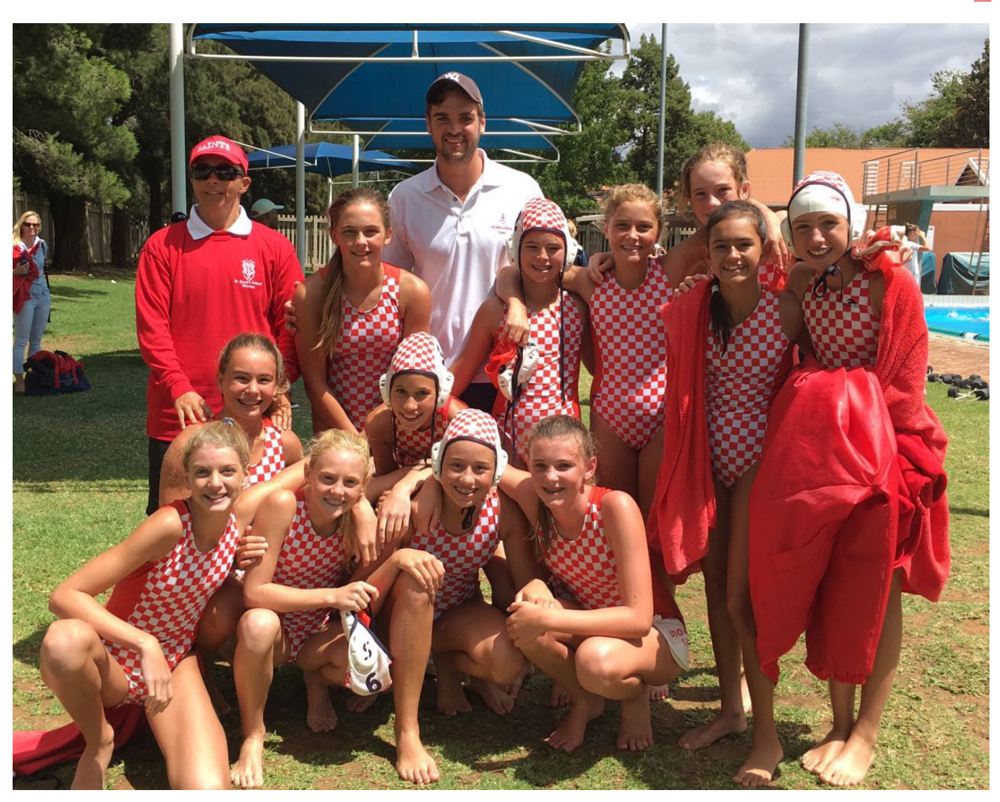
The U13 water polo team