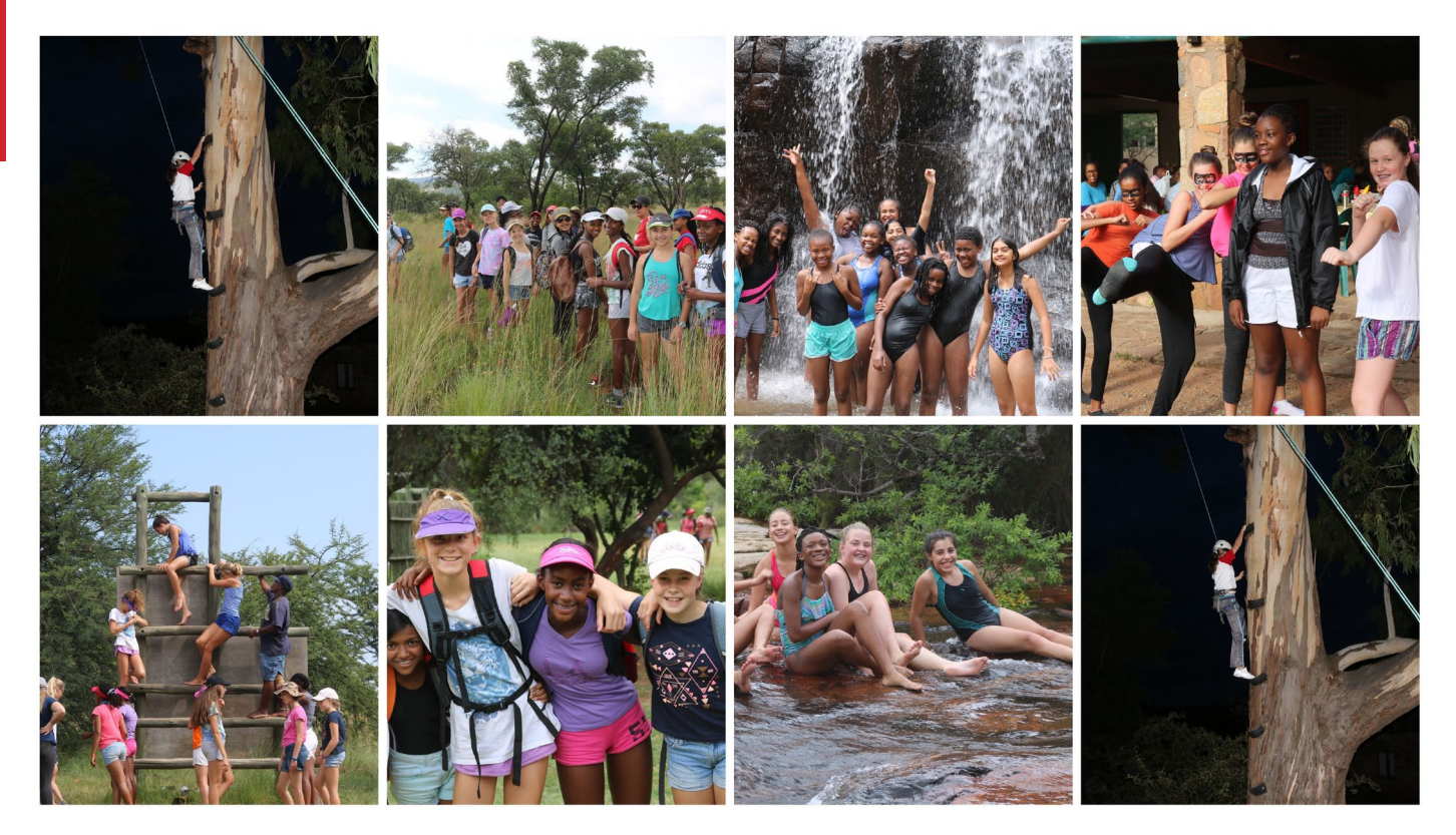
The Grade 7s enjoyed their tour to Kloofwaters where they were able to spend time in the beautiful Magaliesberg developing their leadership skills