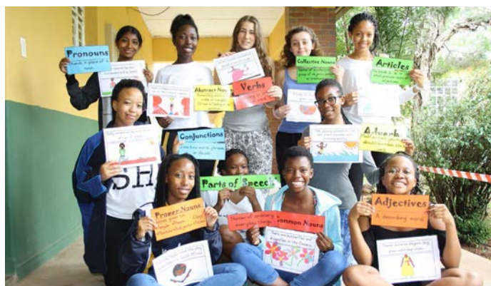
Our St Mary's girls making teaching aids