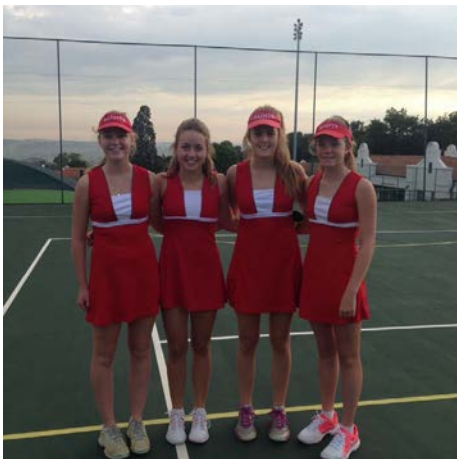
C inter-high team (fourth position)