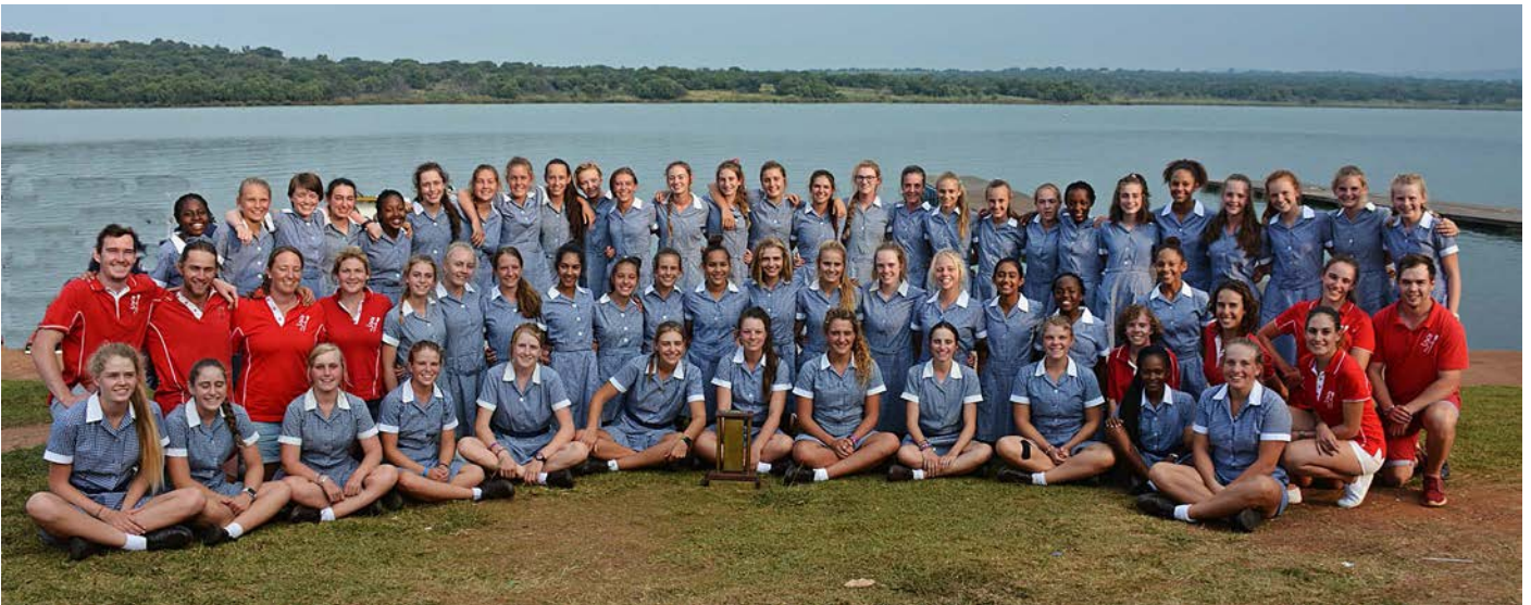
Winners of the South African Schools' Rowing Championships (please see page 14 for more information)