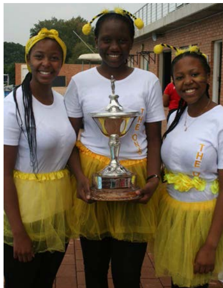
Clayton House wins the 2017 St Mary's inter-house swimming competition

The St Mary's inter-house gala scheduled for Thursday morning 24 February was postponed owing to heavy rain and cold weather and the annual "50m Night gala" on Thursday 2 March was cancelled owing to lightning. Fortunately, the morning of Thursday 2 March was fine and we were able to hold our inter-house gala.