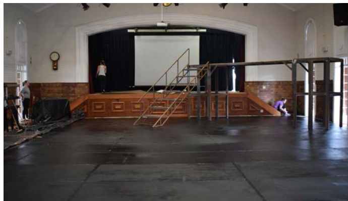
Getting the stage ready of the 2017 Senior School play

The countdown has begun for the 2017 Senior School play and we are as excited as you are. The tech crew girls have been working hard behind the scenes to get the stage ready. After two days of long hours of painting, building and organising, the stage is ready for rehearsals. The play will run from Tuesday 28 to Thursday 30 March. Watch this space for more information regarding this exciting event.