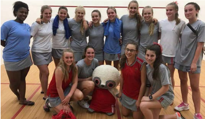
At the St Mary's DSG squash festival

St Mary's participated in the squash festival in Pretoria from 10 to 12 February and achieved exceptional results. St Mary's A and B teams faced each other in the finals. Well done to St Mary's B for taking the honours.