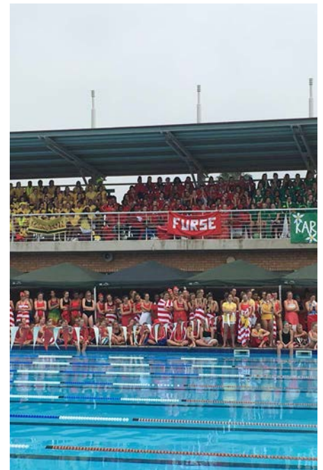
Senior inter-house gala

Clayton made history at the aquatics events last week when they won the water polo, the diving, the gala and the spirit prize at the gala.