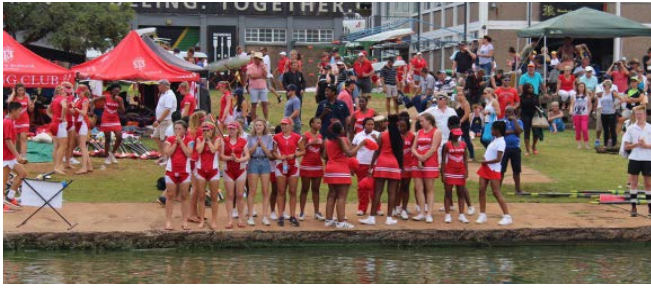
Cheering from the banks of the Roodeplaat Dam