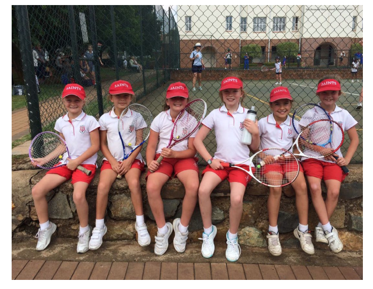
Grade 2 tennis players