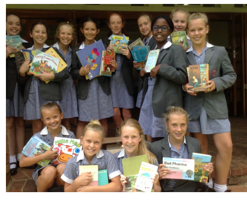
A collection of second- hand books was donated to TOUCH \ensuremath{\mathsf{AFRICA}} LIBRARIES