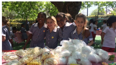
Fun for the sellers at the Grade 1 market day