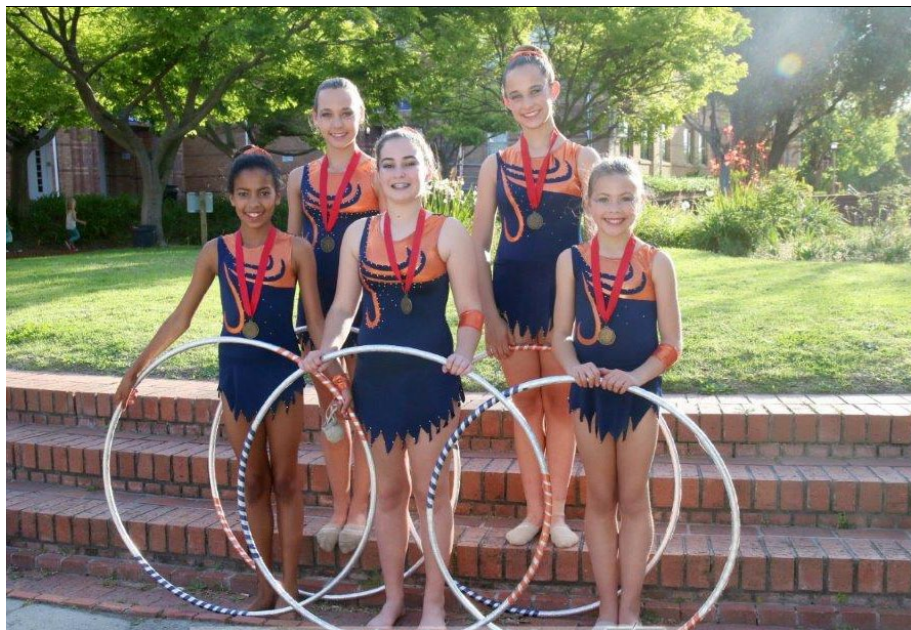
St Mary's group at the gym for life competition