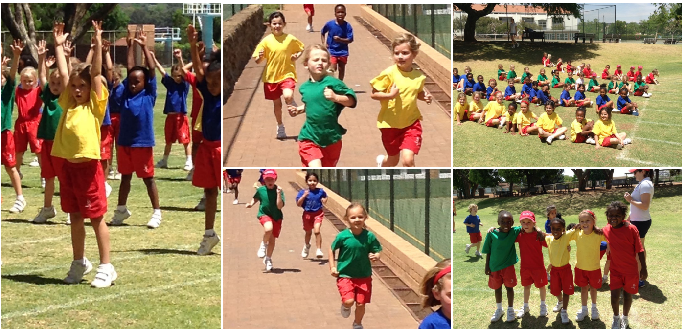
Junior Primary inter-house cross-country