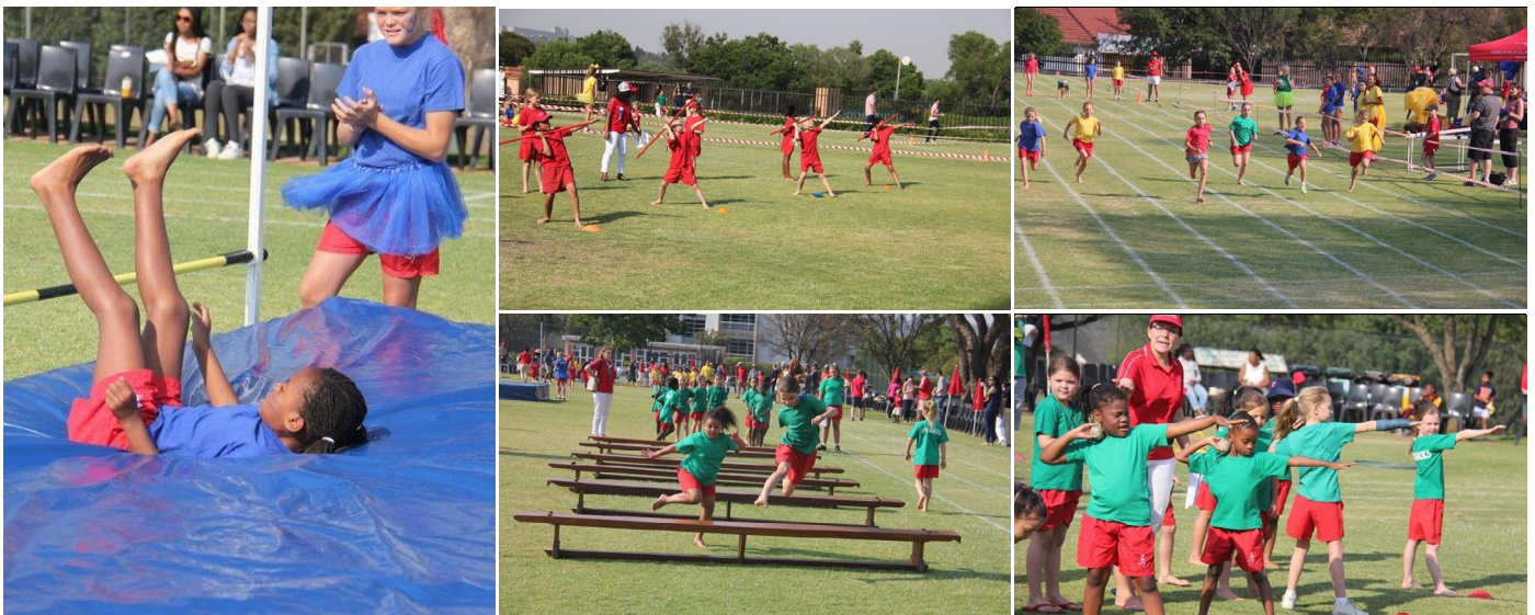
Junior Primary inter-house athletics day, run on 8 October

Head of department: Junior Primary sport