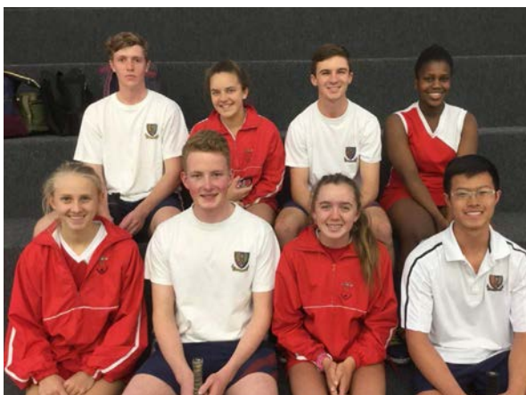
St Mary's team with the St John's team