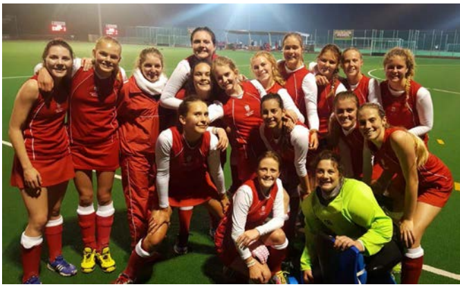
St Mary's 1 st team versus St Stithians