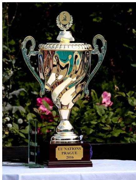
EU Nations Cup