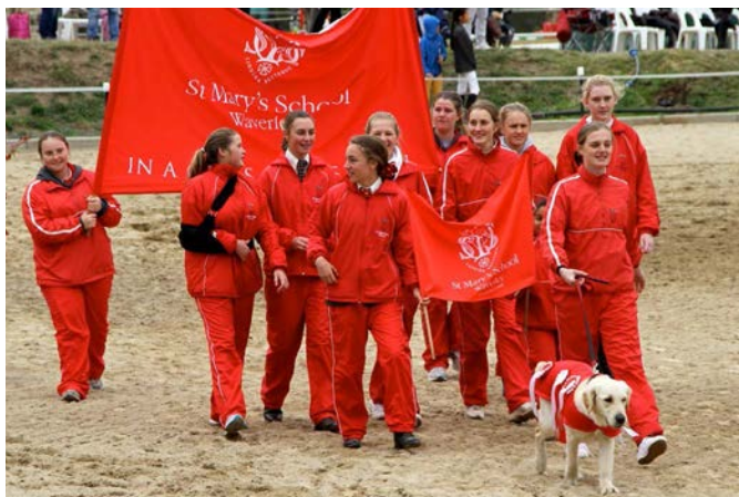
St Mary's girls at the parade