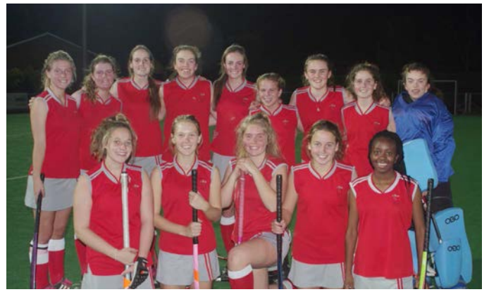
3 rd team