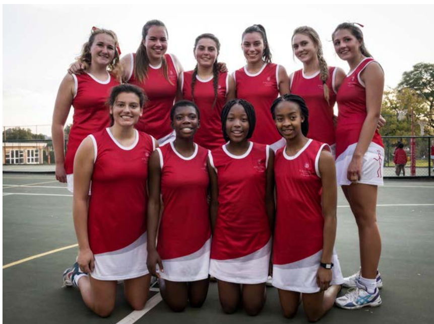
1 st netball team (not in picture: Varaidzo)