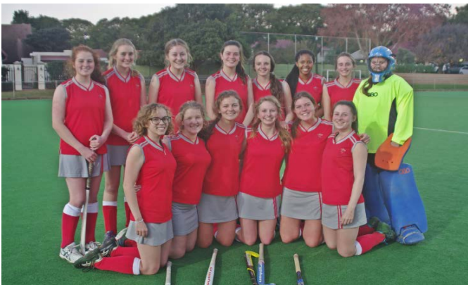
4 th team