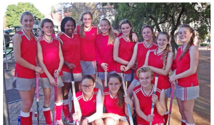
U14 C team