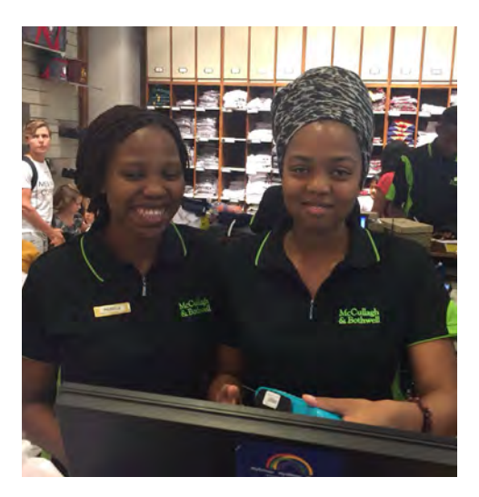
Two St Mary's girls spent the December break as shop assistants at McCullagh and Bothwell in Hyde Park, before beginning their studies this year at Wits and Rhodes Universities respectively