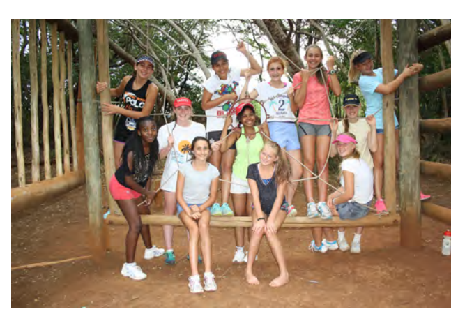
A group of girls pleased about getting their entire team through the giant spider web without touching the sides