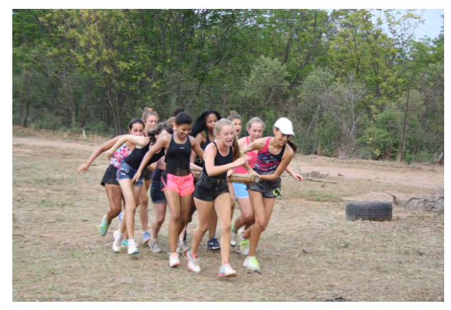
Working as a team