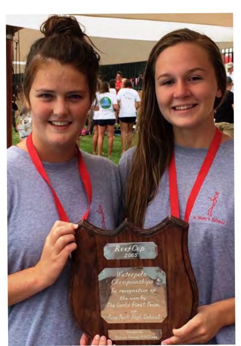
Reef Cup winners