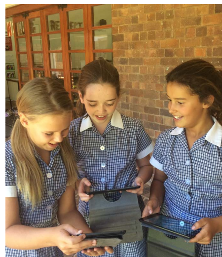
Hard at work practicing the script for their green-screen movie