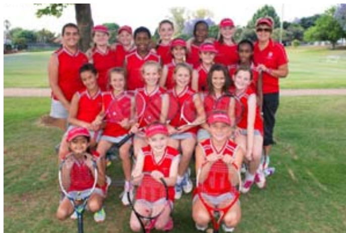
Tennis players who played in the friendly match against St Teresa's on 15 October