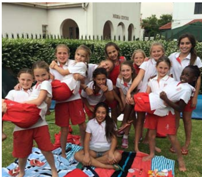
St Mary's divers celebrate after a victorious day at St Andrew's