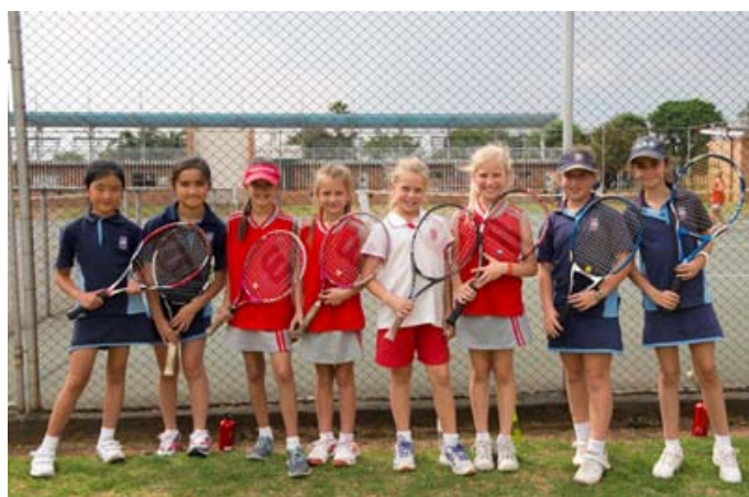
Grade 4 tennis players in the friendly match against Holy Rosary on 8 October