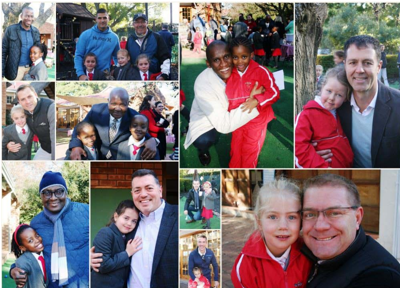
The Fathers' Day service was well attended and the girls loved having dads in their space