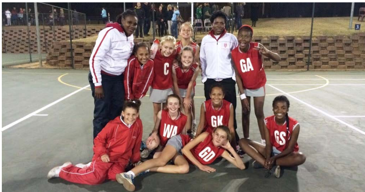
The U12 A Netball team