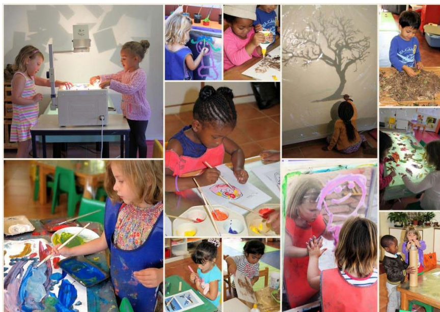
One Hundred Languages of Children in Little Saints