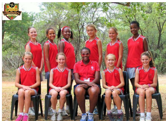
U12 netball team