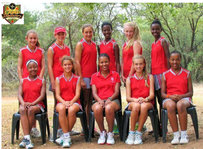
U13 netball team