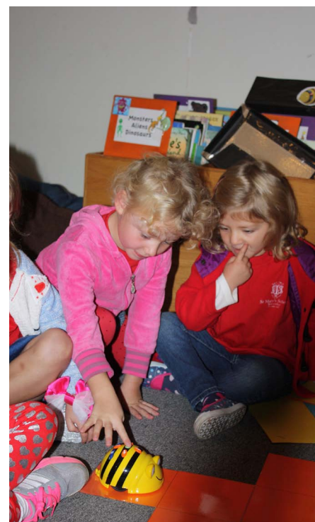
The children at Little Saints have had a brief introduction to coding