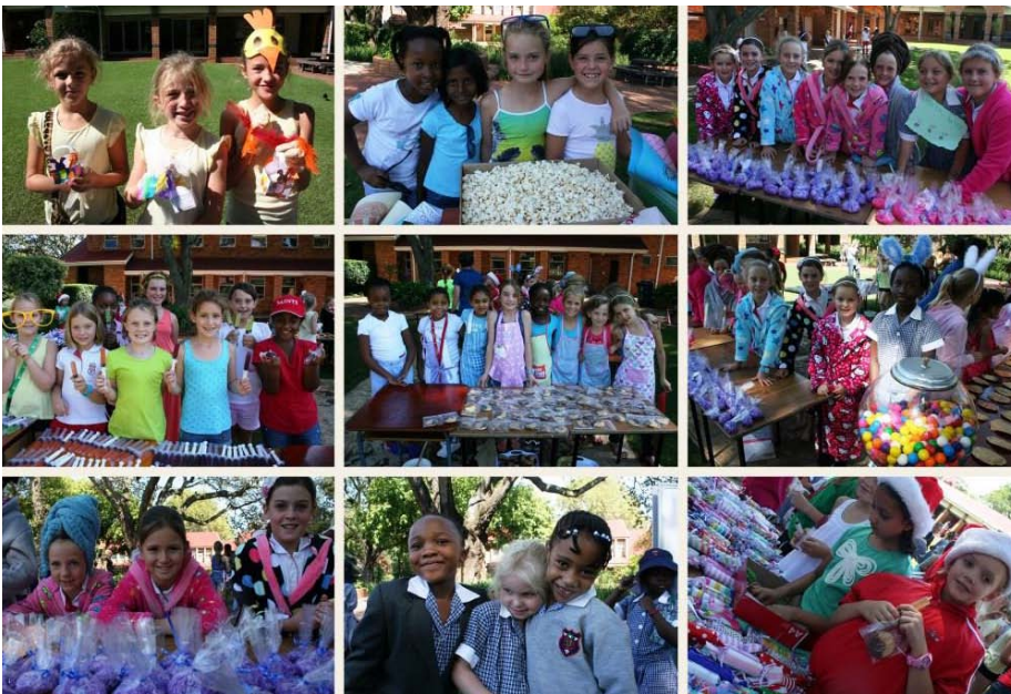
The Grade 3s enjoyed selling their goods at market day