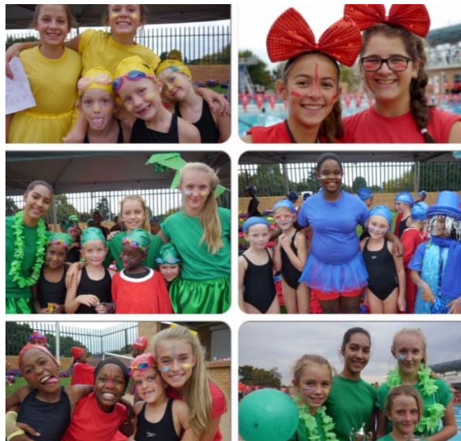
The Junior Primary gala was a great success