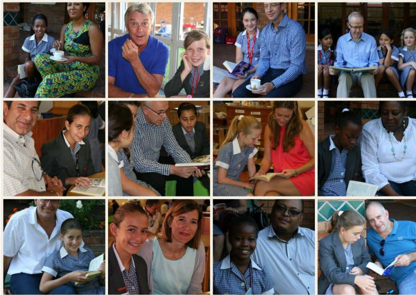
Senior Primary reading morning