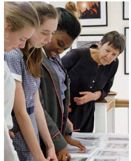
Engrossed in the Cool@School competition