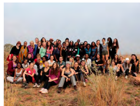
Wilderness School 2