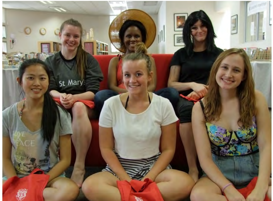
Matric girls, all of whom are part of the group of resource monitors