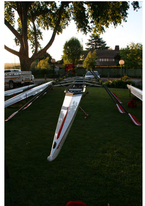
Olympus , the best boat in our fleet