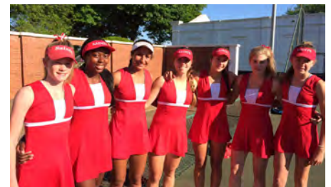
The St Mary's team that played at Hilton