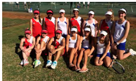
The St Mary's team with the team from St Mary's Kloof, whom they beat in the finals