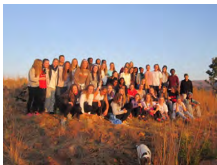
Wilderness School 1