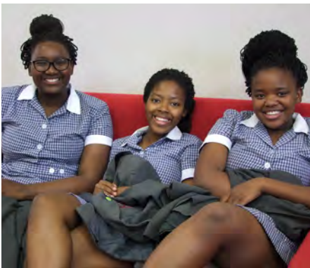
At the matric resource monitors' farewell tea