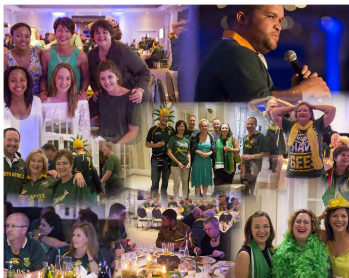
St Mary's Foundation World Cup Rugby Fever dinner