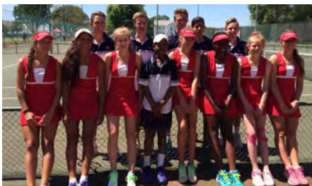
St Mary's girls with their mixed doubles partners from St Stithians Boys' College