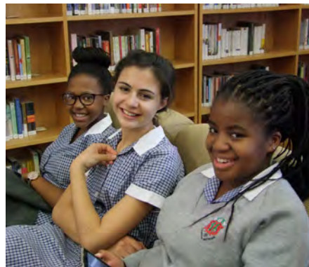
Chatting at the matric resource monitors' farewell tea