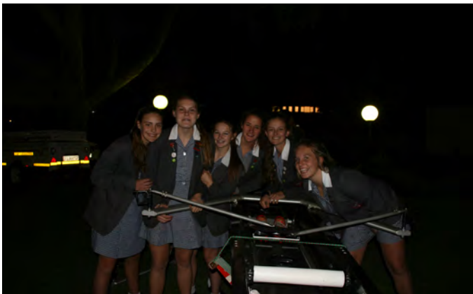
Some Open girls happy at the prospect of touching the Filippi