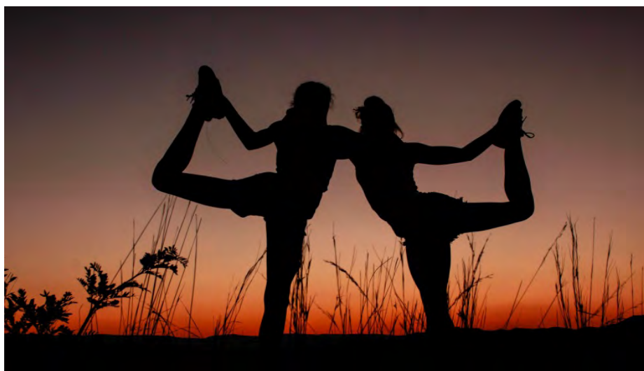
On Sunset Hill

Deputy headmistress; Wilderness School co-ordinator