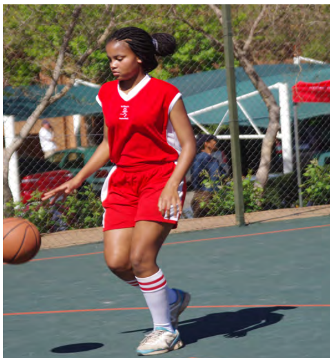
Luntu in action