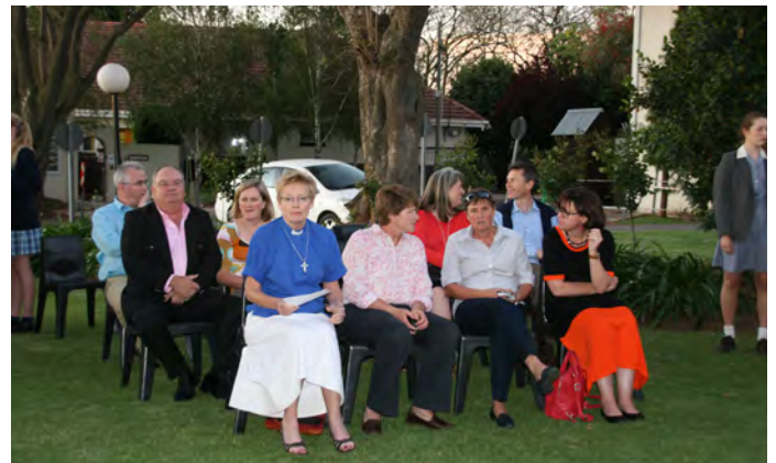
VIPs attending the blessing