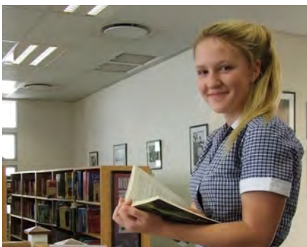
Enjoying the crime novels on display during Bloody Book Week