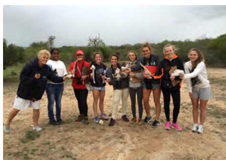
Enjoying an Ecology lesson in the bush