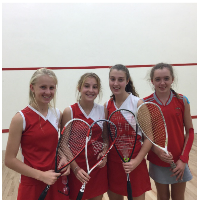
St Mary's B