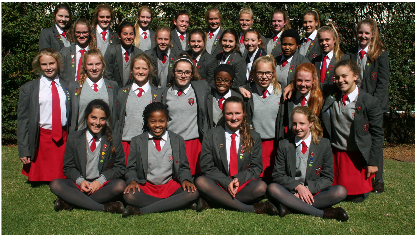
St Mary's girls who have been selected to represent Southern Gauteng

The St Mary's hockey teams have started the league successfully. Over the past two weeks, in the Grays and Malik leagues we have competed against Parktown, Dainfern, Kingsmead and Fourways. With 28 matches being played, the St Mary's hockey teams have won a total of 26 and drawn the remaining two. What is most impressive is the goal tally: the teams have scored 142 goals, and have conceded only one goal.