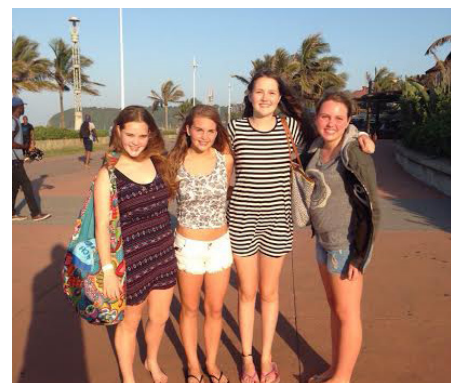
Girls enjoy time at the beach together with their "exchange sisters"