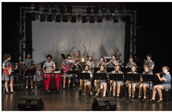
Some members of the Music department