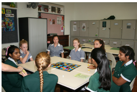
Junior Mathematics 30 Seconds competition