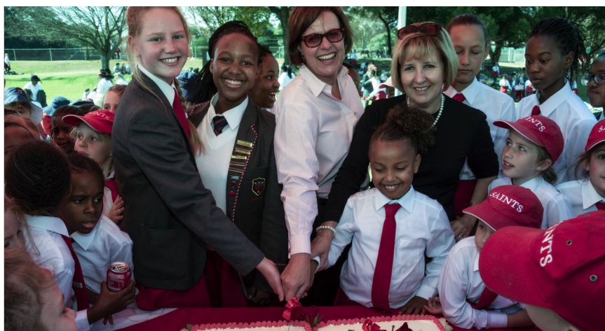
Cutting the cake at our Patronal Festival