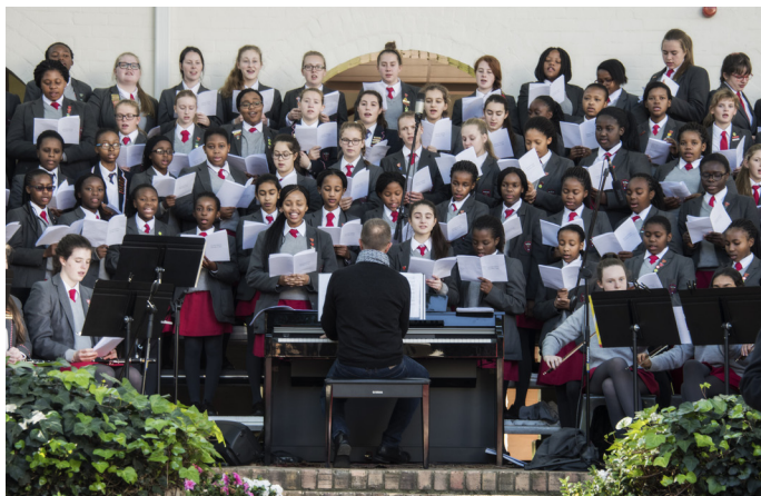
Senior School choir