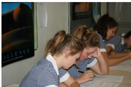
Senior Mathematics competition