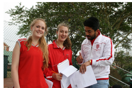
Mathematics advice on the stands while watching hockey