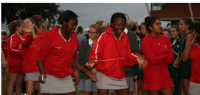
Dance-off at the end of the day