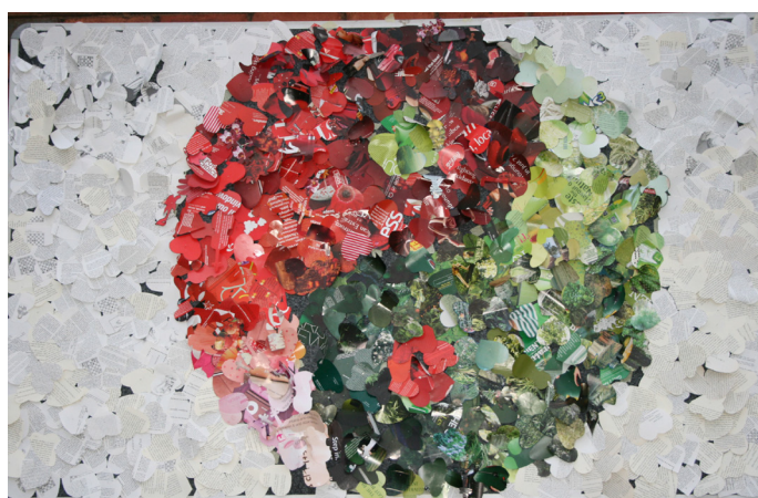
Schools' combined artwork