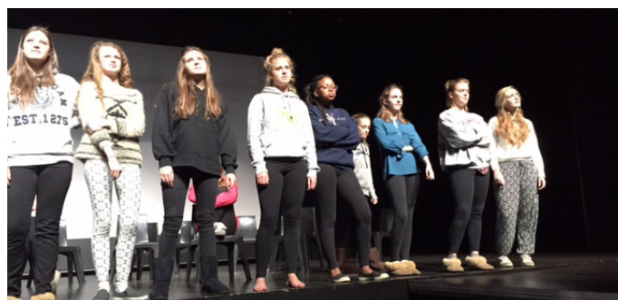
Scenes from Girls Like That