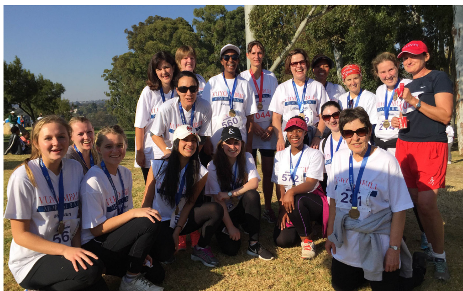
The St Mary's staff and girls entourage