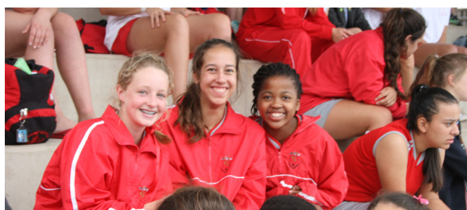
Form I's supporting the 1 st team water polo