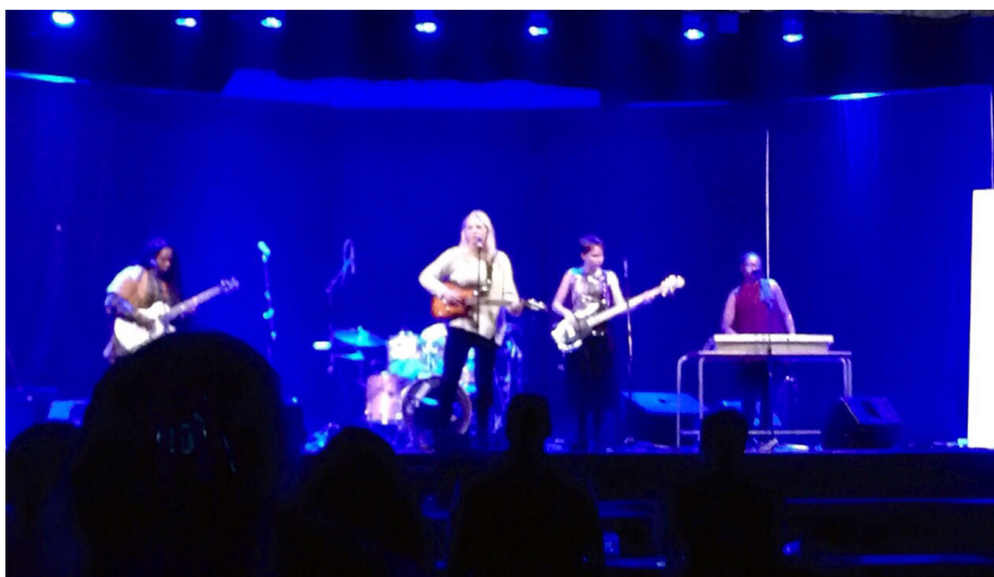
Nuns and Moses