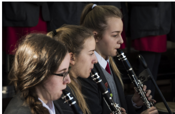
Senior School girls play their clarinets

This year's Patronal Festival was a particularly special event. The diversity of our school was showcased through many musical items from Grades 2 and 3 in the Singing Angels, the Senior Primary choir, the Senior School choir and orchestra, as well as the marimba bands, the traditional choir and solo items by some of the Subject Music girls.