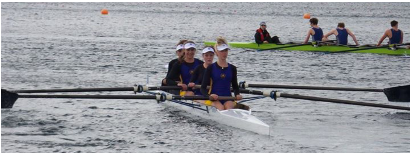
U17 four team