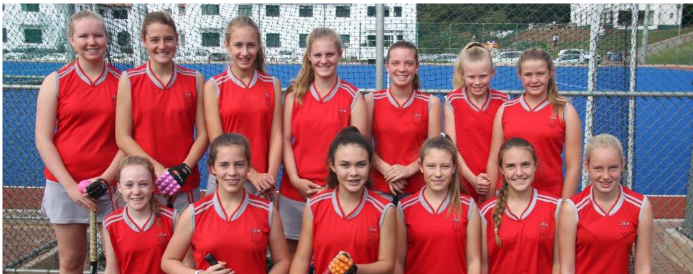
U14B hockey team that played in the Roedean Festival

The U14B hockey team took part in the Roedean U14A Hockey and Netball Tournament this past weekend. They did superbly well as they played most other schools' A teams. On their way to winning the A pool, their results were as follows: