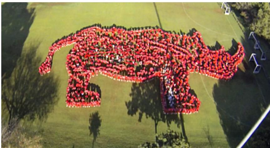
During the last week of Term 1, the entire St Mary's School community supported the plight of the rhinos in South Africa by "becoming" a rhino (see page 3 for more information)