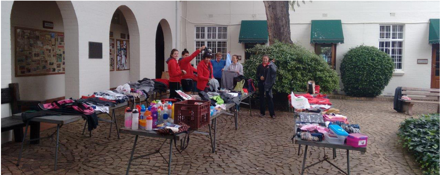
Lost property displayed on Friday 8 May