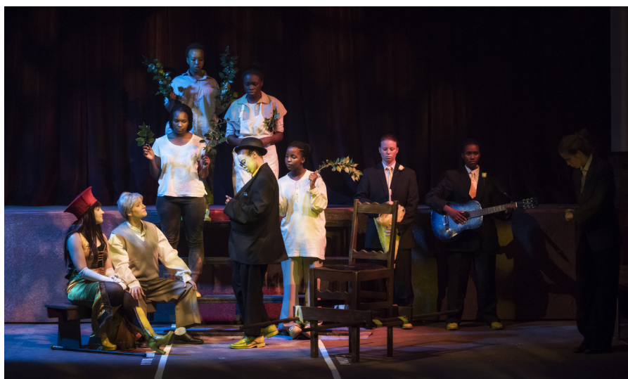
A dramatic scene from our play - an adaptation of The Visit