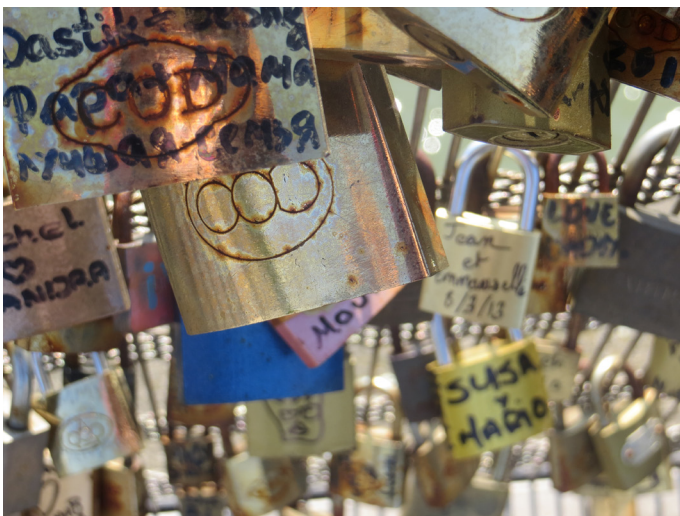
Tanyaradzwa - Throw away the key

We congratulate the following girls who are our finalists in the photography competition: