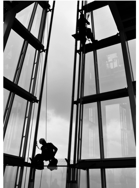
Susan - Suspension