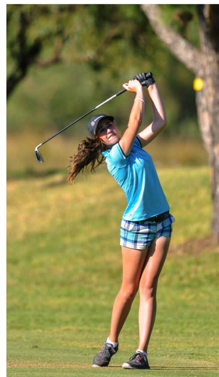
Mercedes in action at the Sunshine Ladies' Tshwane Open