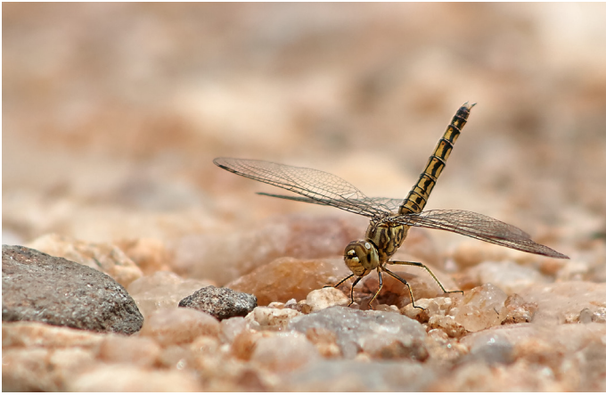
Bronwyn - Inquisitive dragonfly