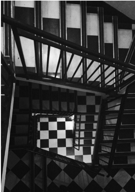
Nicole - Well, stare