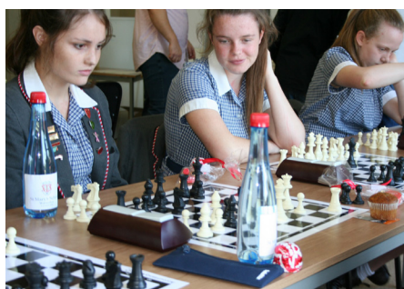
St Mary's girls in action