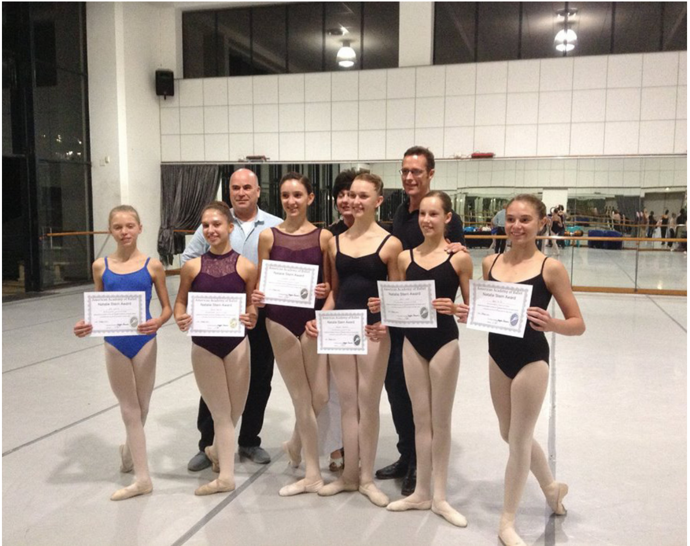
The awards evening was held at the Joburg Ballet Studio