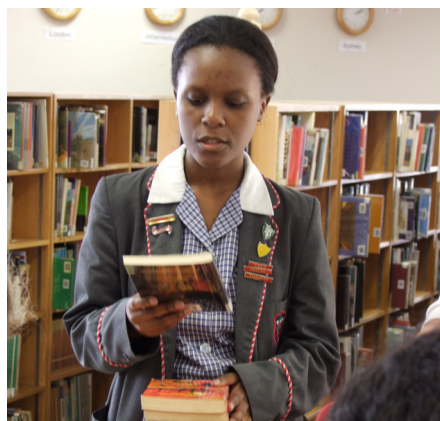
Simangaliso in action at the book chat podcamp