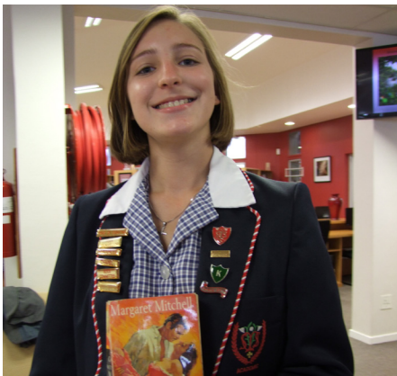
Emily used her research skills to win a number of times