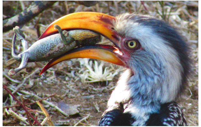
Chloe - The hungry hornbill