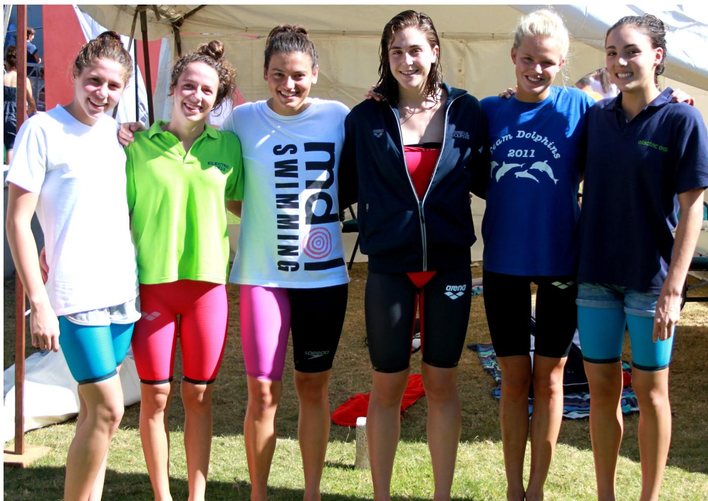
Our girls at the Level 3 Championships

Six of our girls swam in the Level 3 Championships in Port Elizabeth last week: