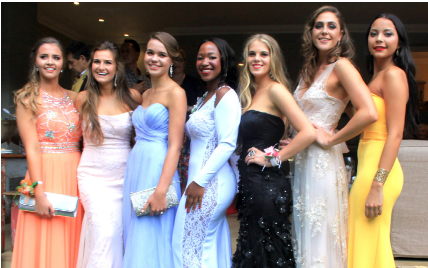
Some matric boarders looking glamorous at the matric dance