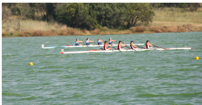
St Mary's U14s taking the lead at the Jeppe Regatta

It was a fantastic experience for the team and the coaching staff. We are proud of the girls. The overall approach to the regatta, the mature response to the day's events and how they conducted themselves throughout the weekend were exemplary.