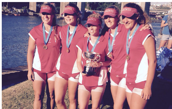
Winners of the Buffalo Regatta first quad race

The senior rowing girls attended the Buffalo Regatta and Selbourne Sprints two weekends ago. The regattas are held on the Buffalo River in East London. This river is heavily affected by the tide and the wind. Our girls raced in very challenging