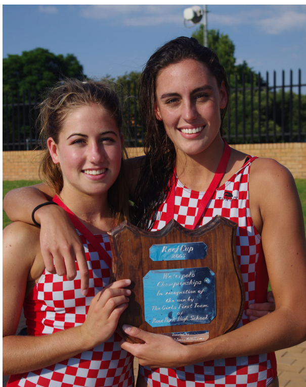
Captains with the Reef Cup