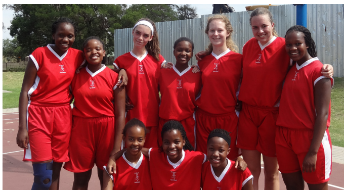
U16 team - 2 nd at AISJ