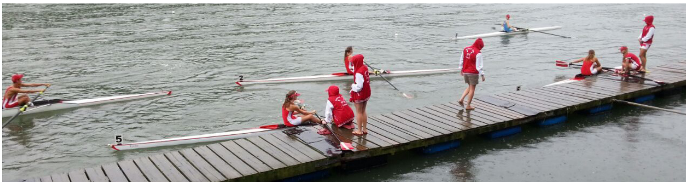
Wet and chilly racing conditions for Selbourne Sprints