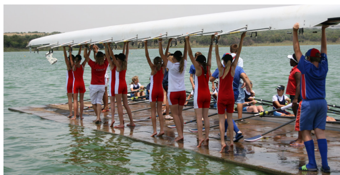
The U14 octuple preparing to place their boat in the water

On 21 February, the St Mary's rowers participated in the Jeppe Regatta. The regatta was for the U14 and U15 rowers. The girls had to race in a strong wind and are congratulated on their fantastic results. The U15 girls came 2 nd in quads and 3 rd , 6 th and 9 th in doubles. The U14 girls came 1 st in the quads and raced in the new octuple