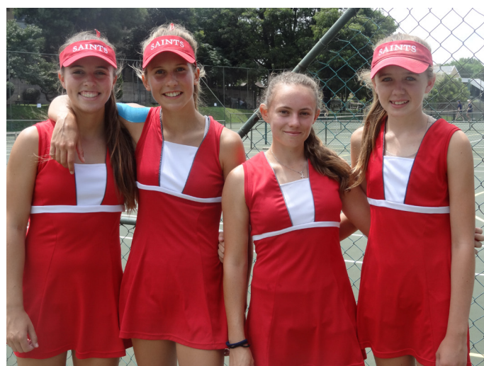
The winning B inter-high team