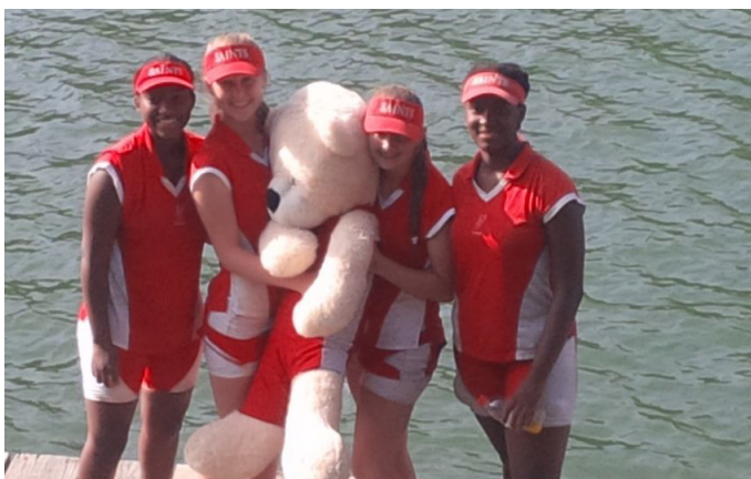
'Big Red' supporting our racers