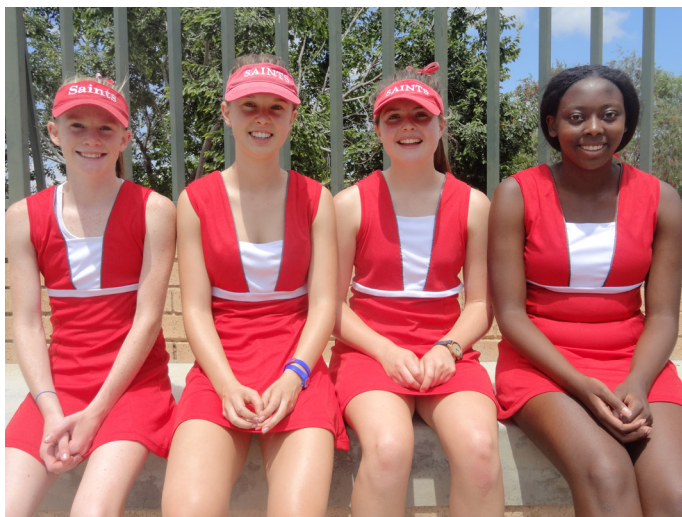
The St Mary's C team that lost in the finals of B inter-high