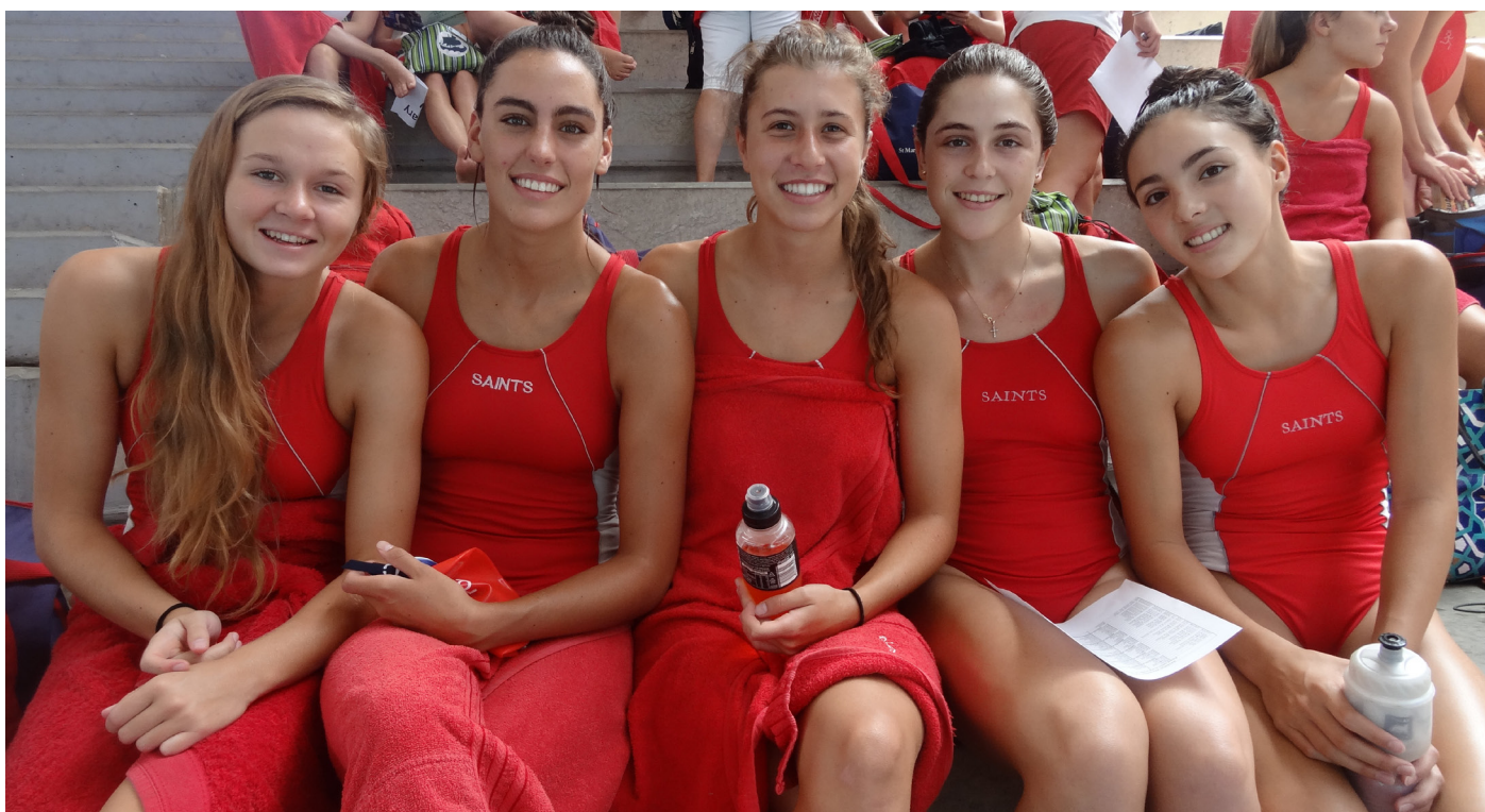
St Mary's swimmers

The girls have been pushing hard and working long sessions in preparation for inter-high, which is the culmination of the school swimming calendar.