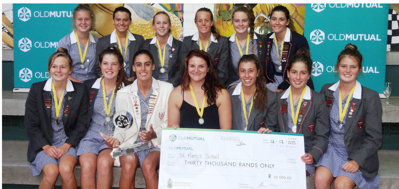
Holding the winner's cheque

The Old Mutual Cup finals took place on Saturday 14 February. The St Mary's water polo 1 st team were up against St Peter's College in the semi-final and beat them 6-2, which put them in the final against Roedeian School. After a long day of play-off games and a mini swimathon for the development swimming programme, the girls were ready to take on Roedeian in the final.