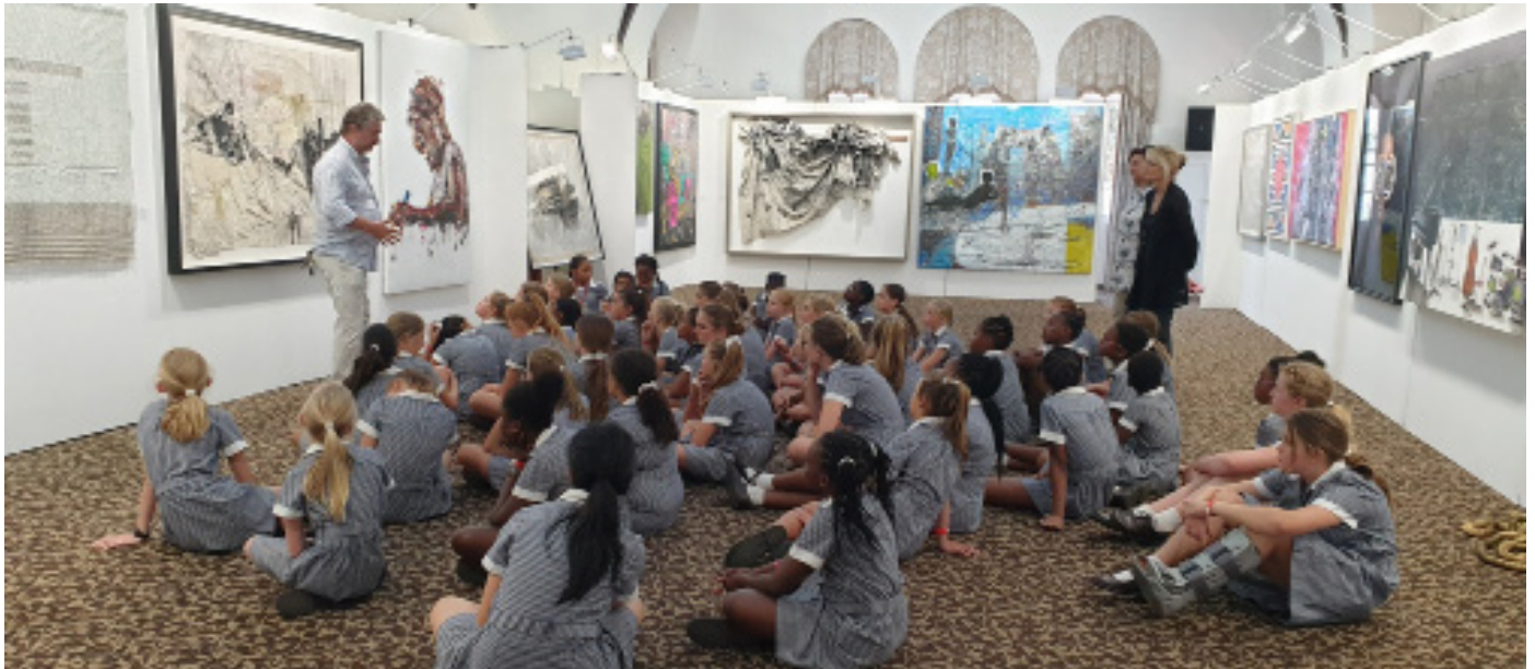
Grade 5 girls at the SAFFCA exhibition at Villa Arcadia.