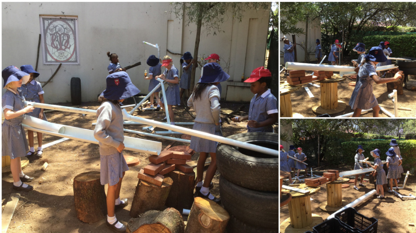
The Junior Primary girls exploring, collaborating, building houses and creating a marble run in our loose parts garden