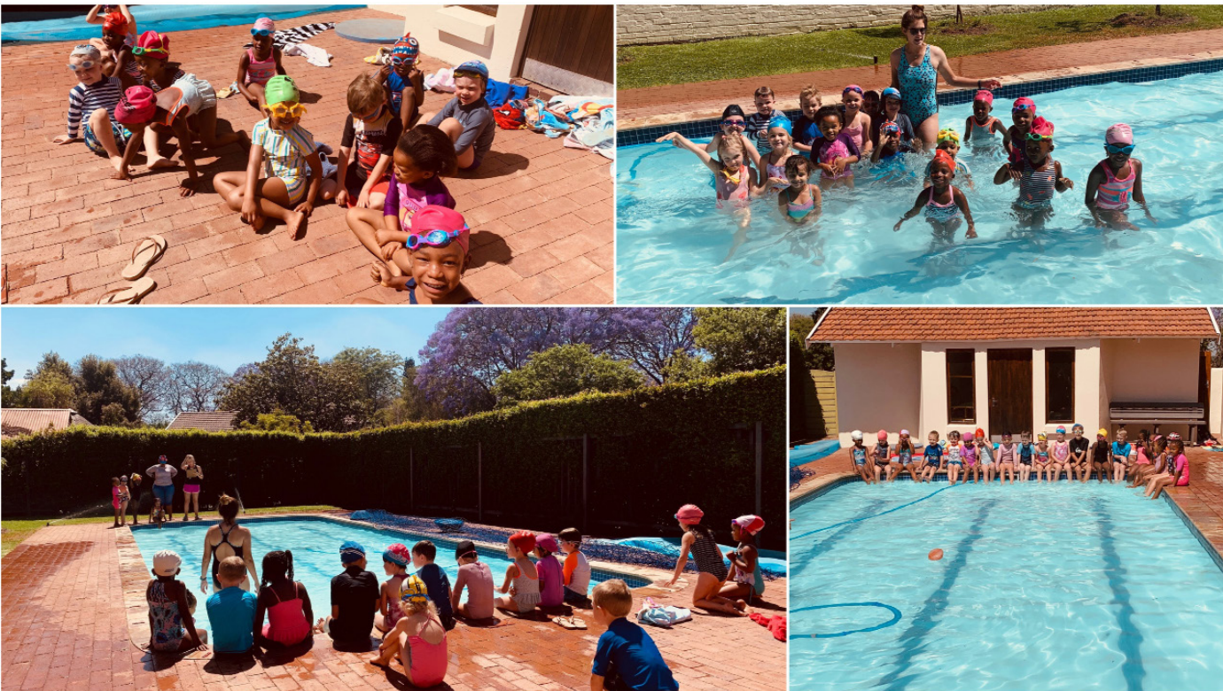
Little Saints children enjoying the learn-to-swim pool