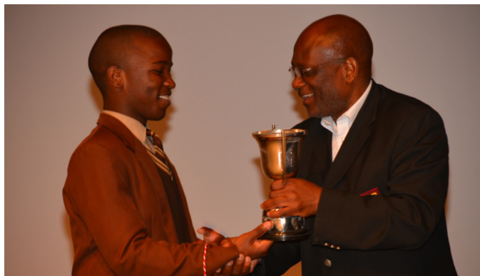
Ikusasa Lethu prizegiving