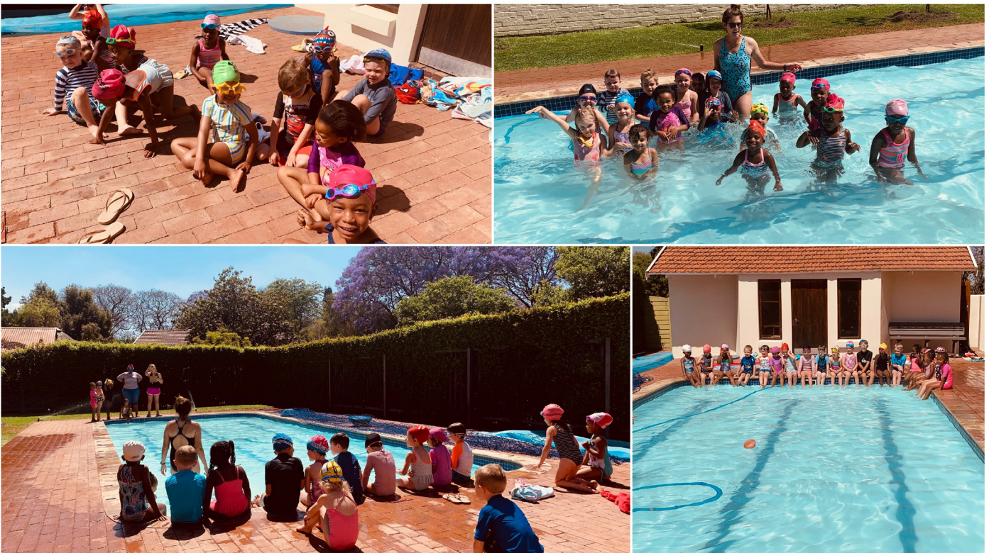
Little Saints children enjoying the learn-to-swim pool