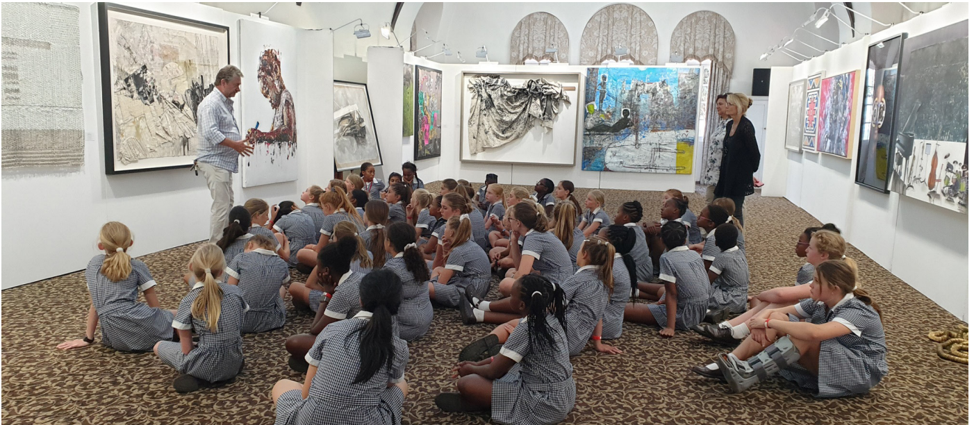
Grade 3 and 5 girls at the SAFFCA exhibition at Villa Arcadia.