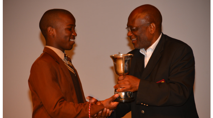
Ikusasa Lethu prizegiving