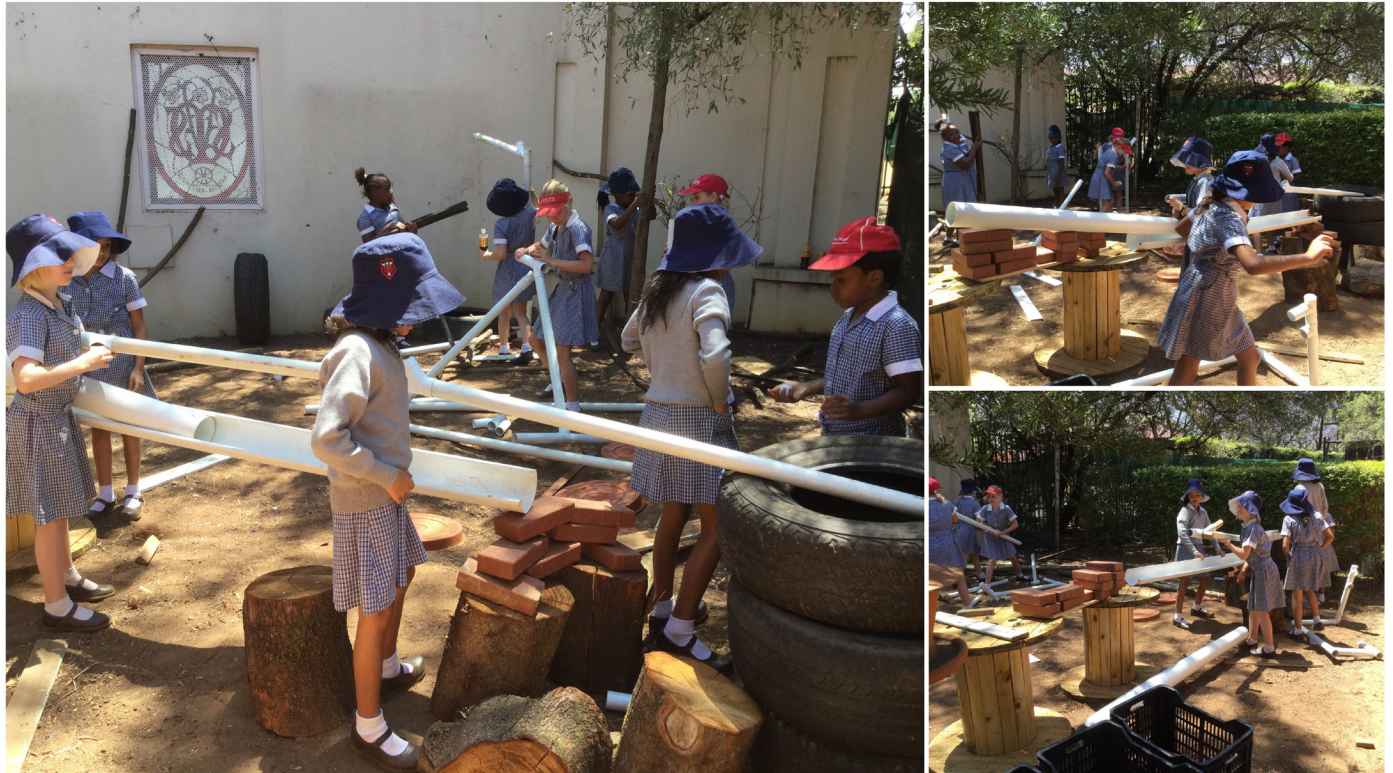
The Junior Primary girls exploring, collaborating, building houses and creating a marble run in our loose parts garden