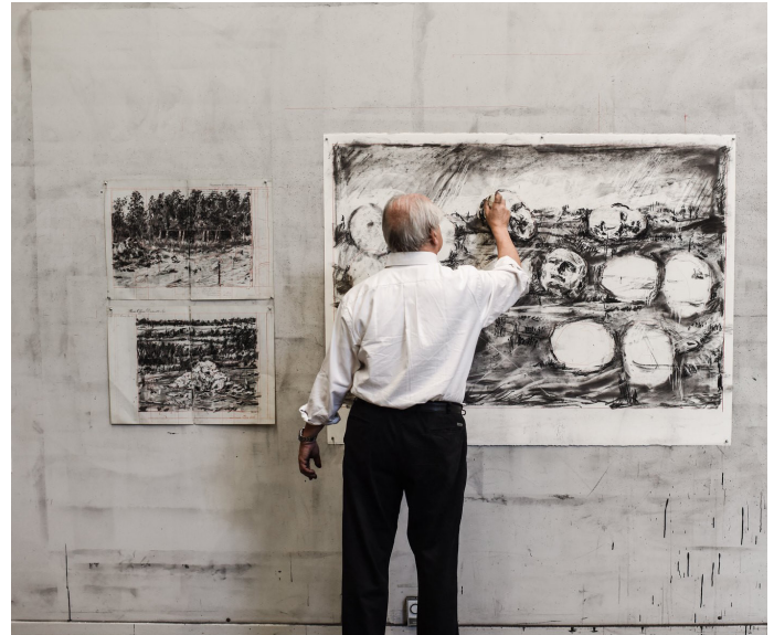
"All children draw. I just didn't stop." William Kentridge