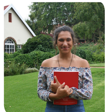
A few matriculants from the class of 2020 arriving at school on Tuesday 7 January to collect their final matric results