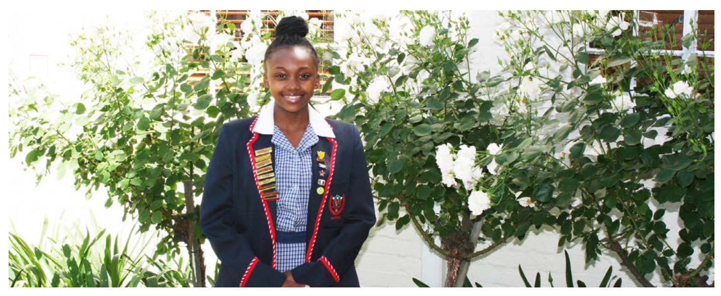
Andindedwa has been awarded a Cultural honours blazer