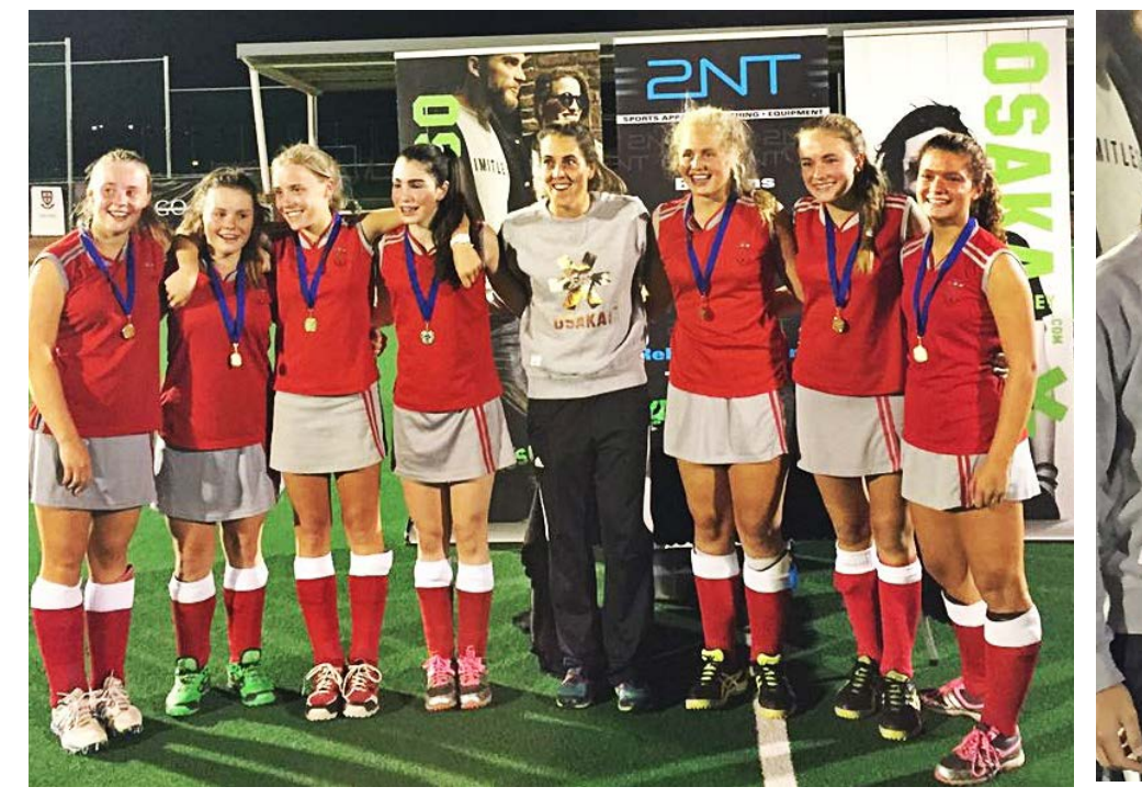
Winners of the Southern Trappers League