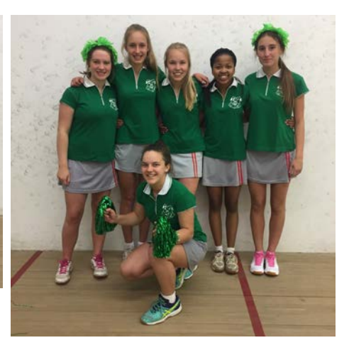
Well done Karney which won overall