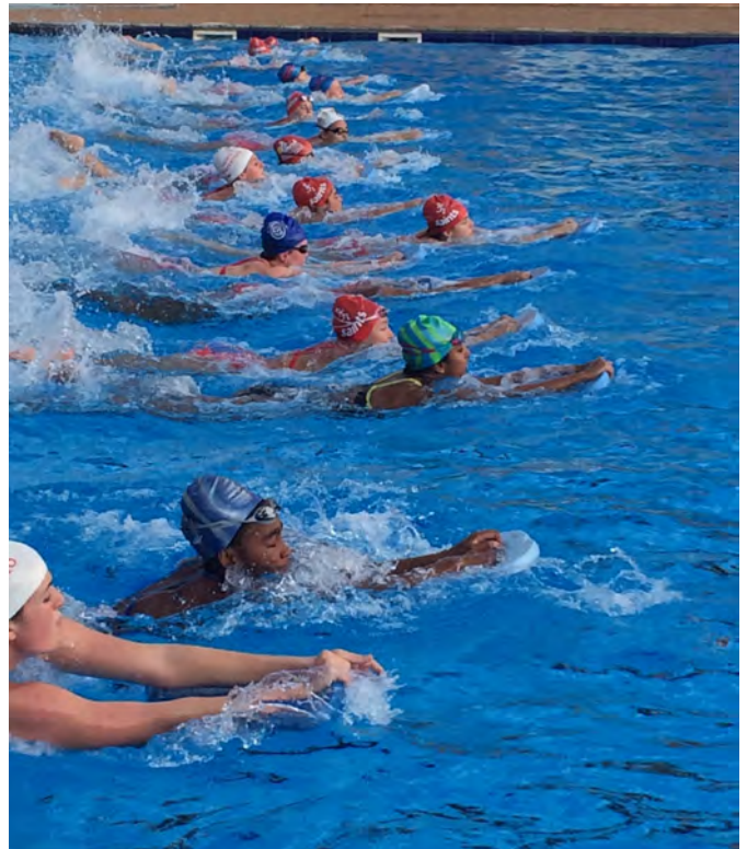
Quix' girls setting off on a kick set