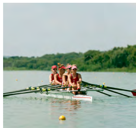
1 st quad ready to rumble