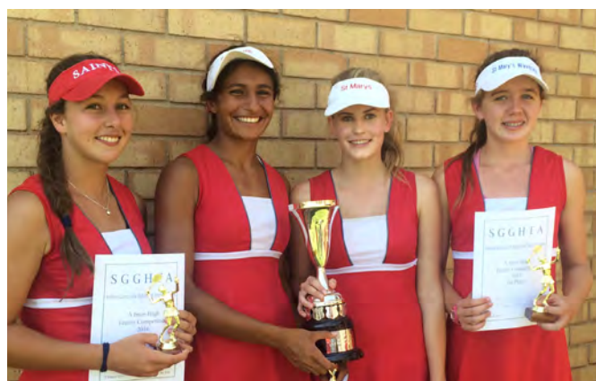
St Mary's School, Waverley, winners of the A inter-high tennis