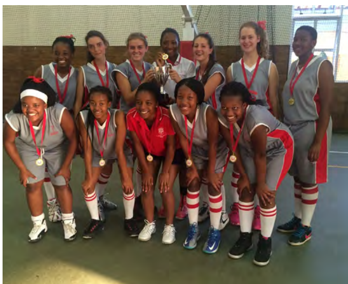
Proud of their medals