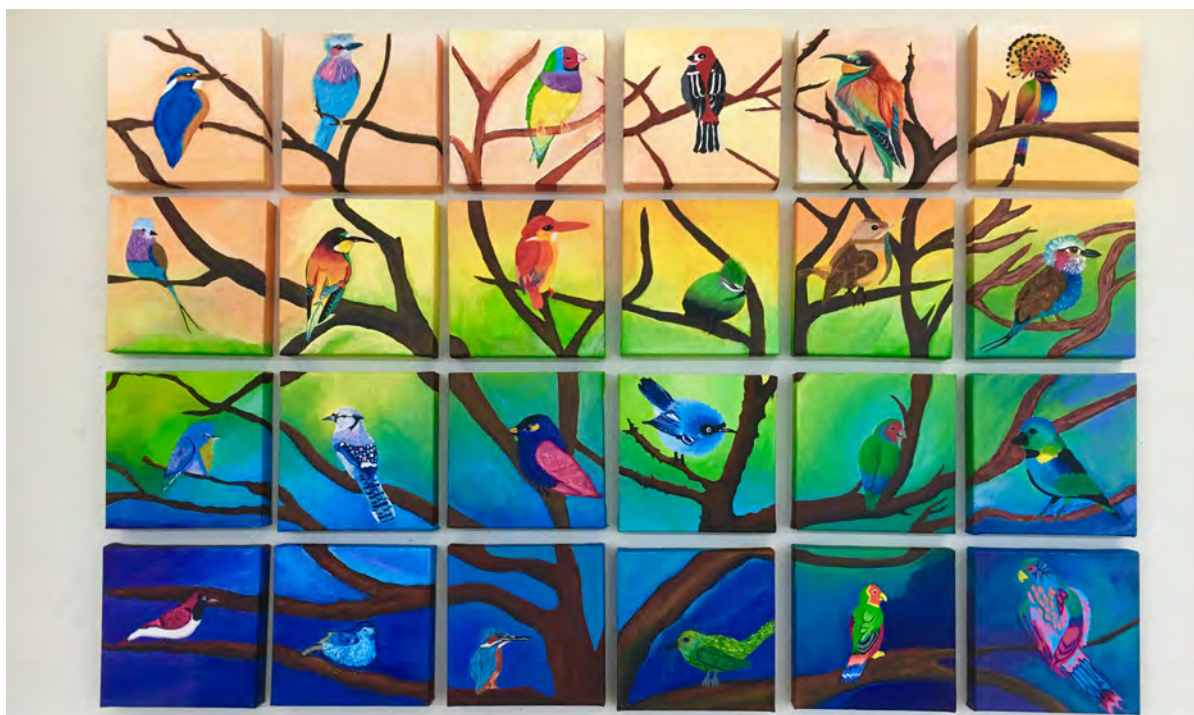
Display in Woodwinds