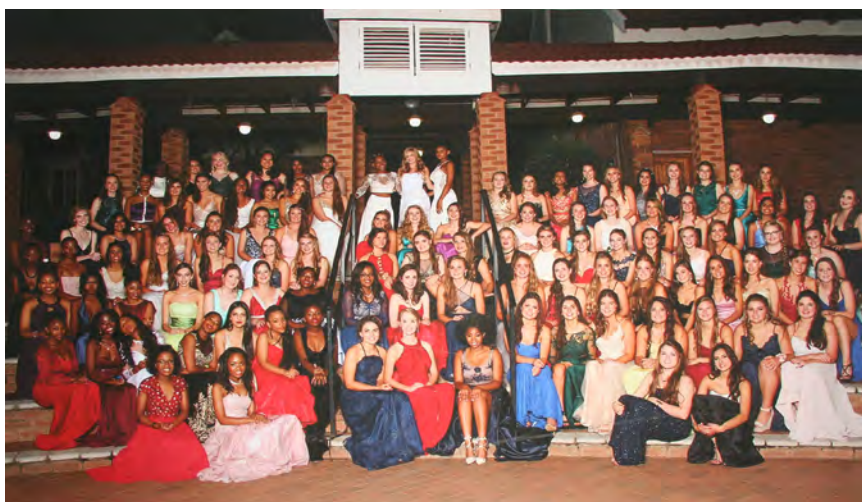
Matric dance 2016