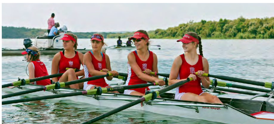
3 rd quad at the start of their race. The result was a sterling bronze!

This past weekend, the rowers performed superbly at the South African Schools' Rowing Championships. The champs began with the bus departing from school at 05h30 on Friday morning, and ended at 17h00 on Sunday. It was a long, hot weekend but the spirit was outstanding. At the end of the first day we were sitting 29 points behind St Andrew's who were in 1 st place, and by the end of the weekend we had closed that gap to six points, taking home 2 nd place overall. We had 33 crews in finals and we won a total of 16 medals, five of which were gold. Both the U14s and the Opens won their respective age group award.