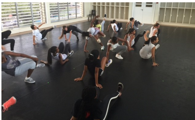
Having fun in a hip hop class