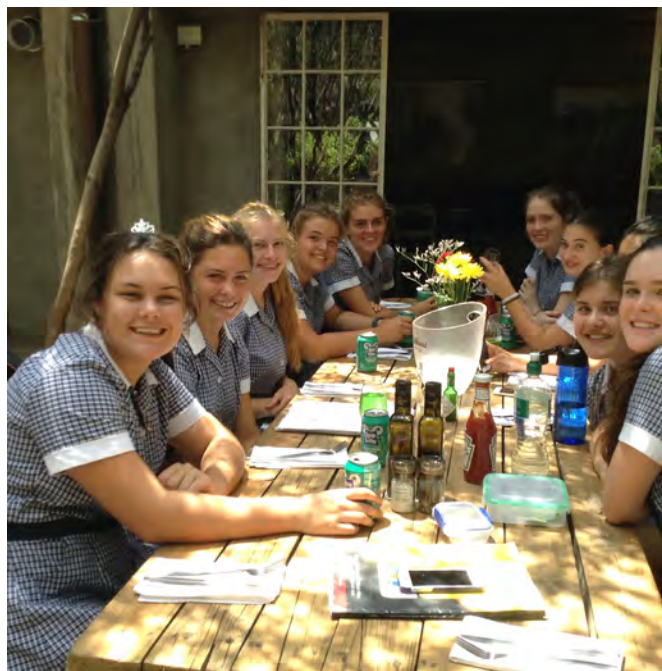
Form V Geography girls enjoying lunch during their urban geography outing