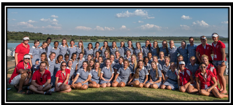
St Mary's rowing club 2016