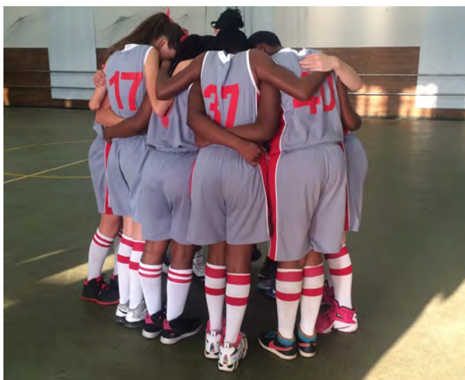
Bonding before the game

With basketball coming to an end for this term, St Mary's basketball team played in the Redhill Basketball annual tournament.