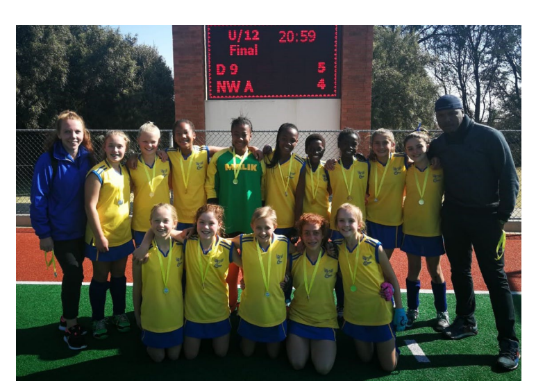
Southern Gauteng D9 U12 team