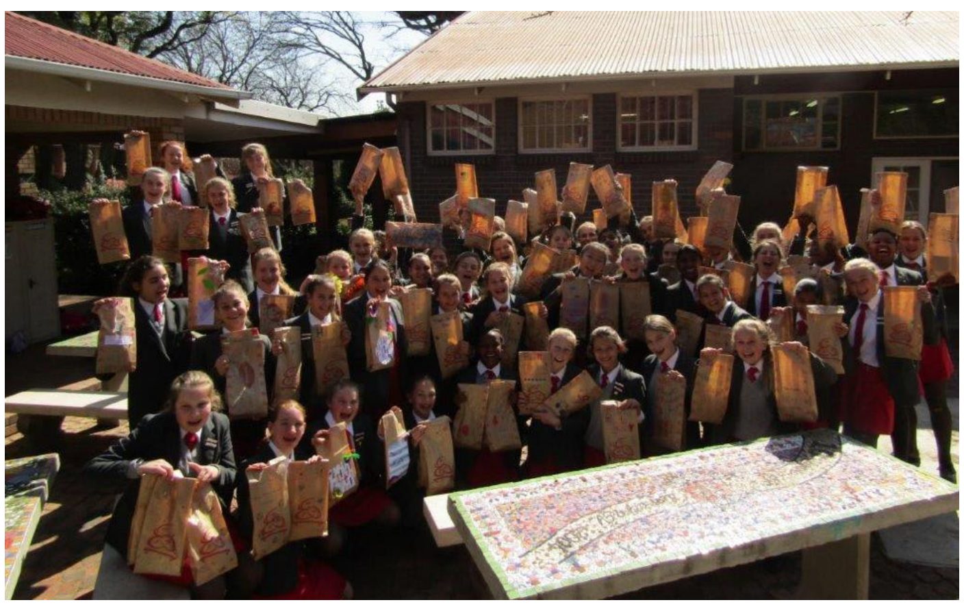
Senior Primary girls delivered Mandela Day packs to HA Jack School