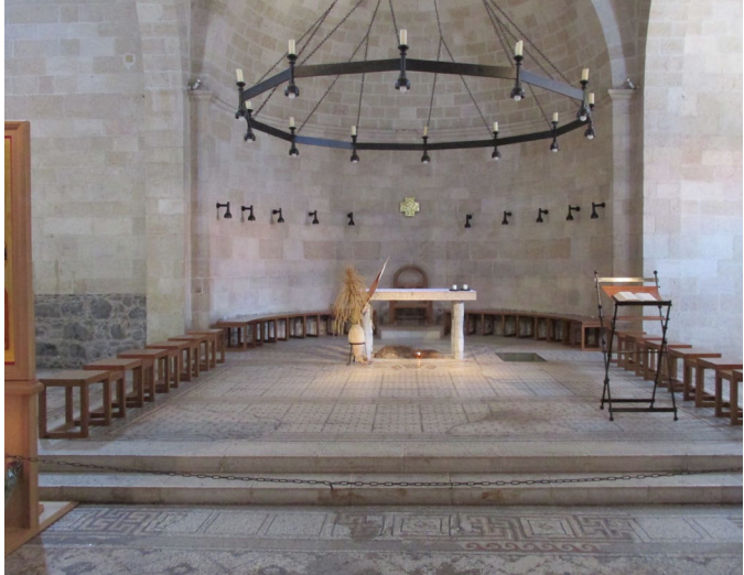
The altar within the Church of the Seven Springs, with the stone beneath it