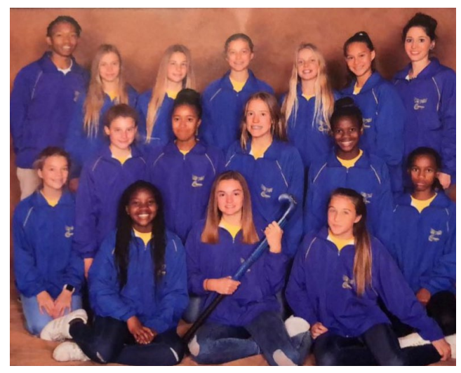
Southern Gauteng D9 U13 team