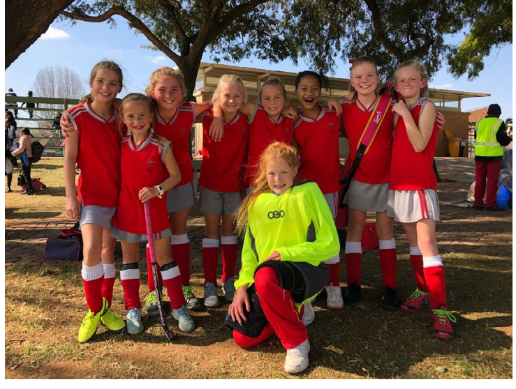
Grade 4 A hockey team

On Friday 6 July, our teams played matches against Roedean. St Mary's won 10 matches, drew two and lost two. On 13 July, we played matches against Brescia. Again our teams did very well – winning nine matches, drawing three and losing only one.