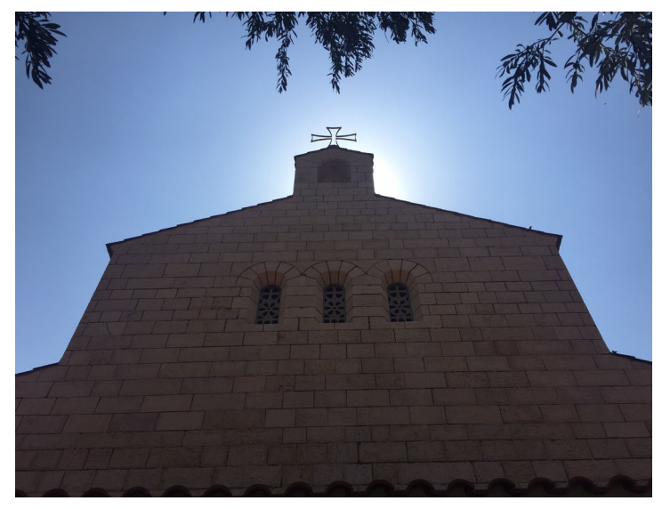
"Taking the five loaves and two fish, he looked up to heaven, and blessed and broke the loaves, and gave them ..." (Mark 6:41)