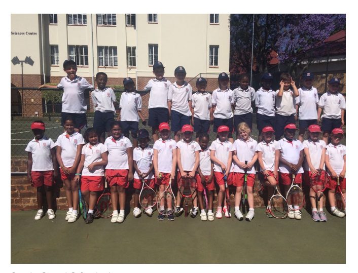
Grade 2 and 3 festival