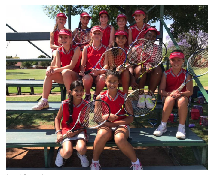
A and B tennis team