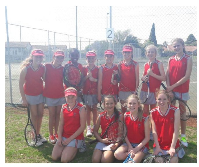
C and D tennis team