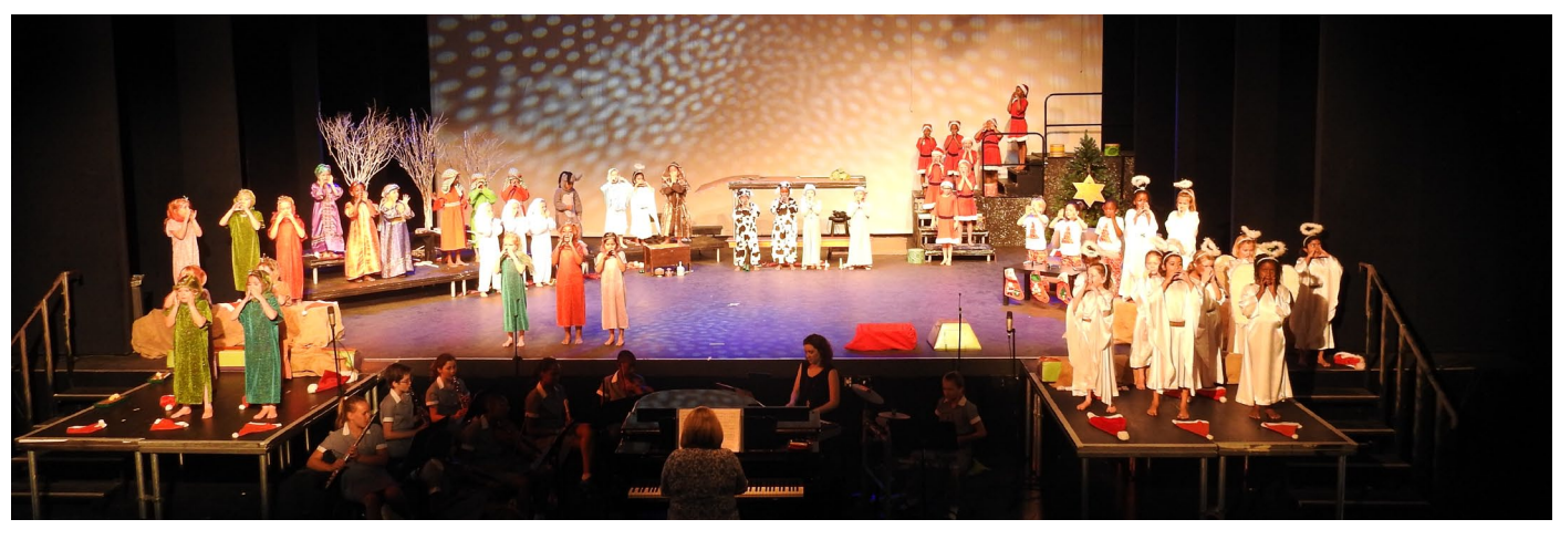
The Grade Os performed the Nativity play with heartwarming sincerity