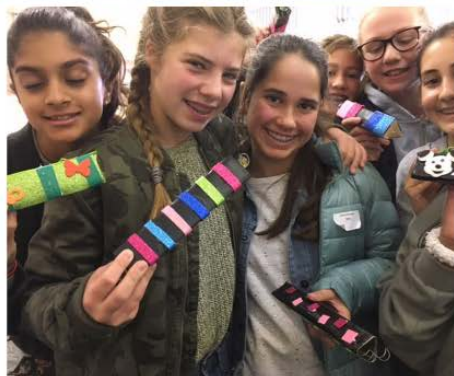
Creativity generated beautiful work and big smiles at the Grahamstown Fringe Festival