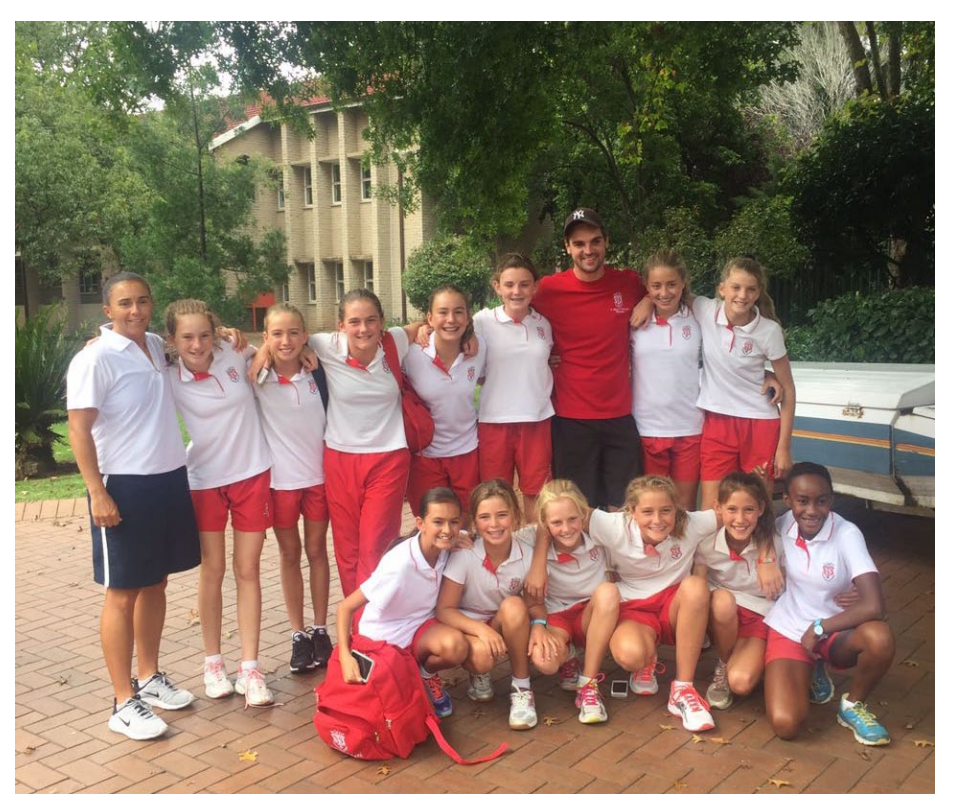
The water polo team