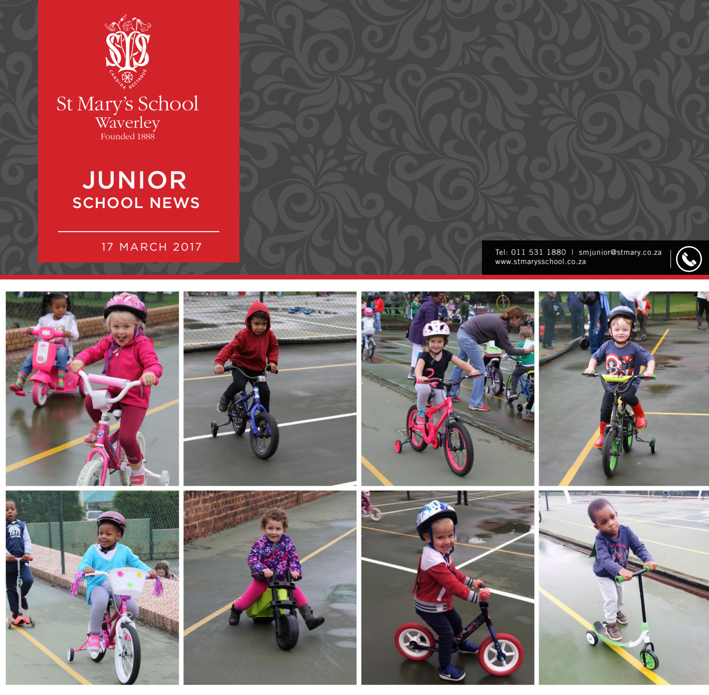
Our annual wheelathon was a wonderful success despite the heavy rains during the week