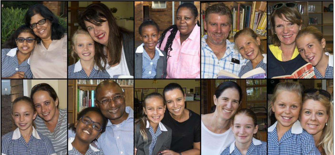
Grade 5 girls reading with their parents