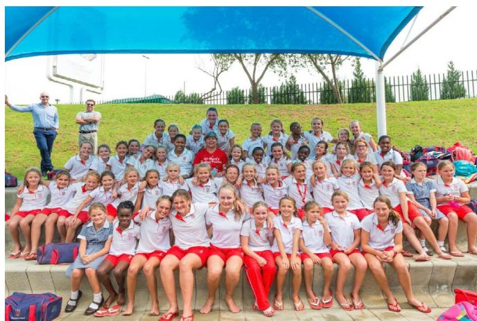
C and D swimming teams