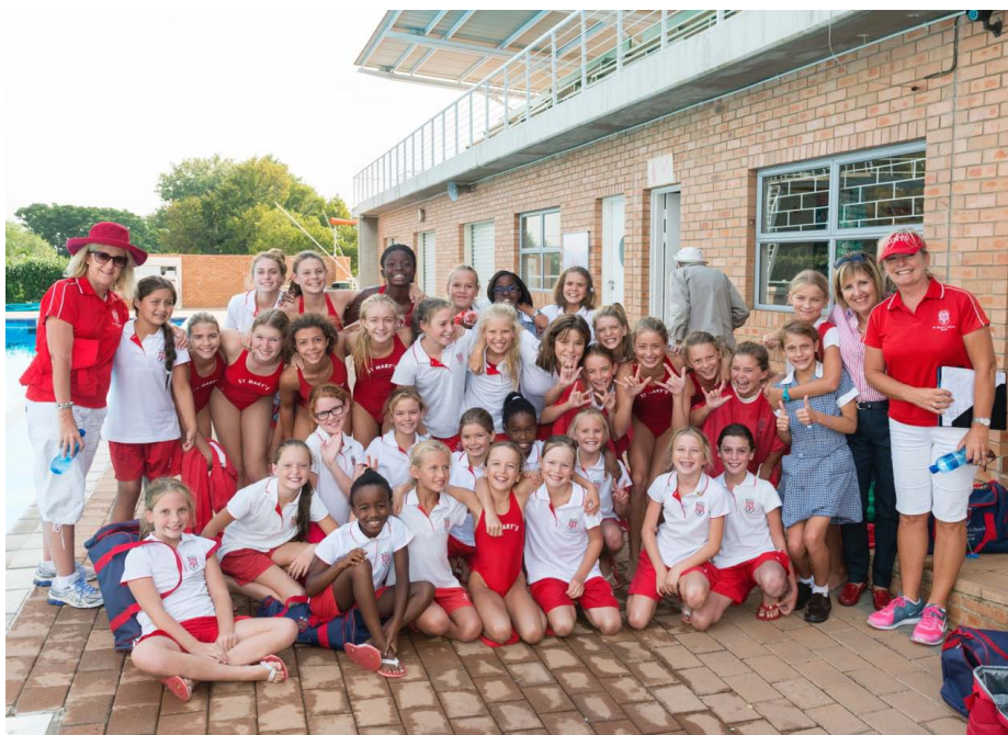
The B team at the Prestige Gala