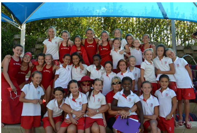
A team gala at St Peter's