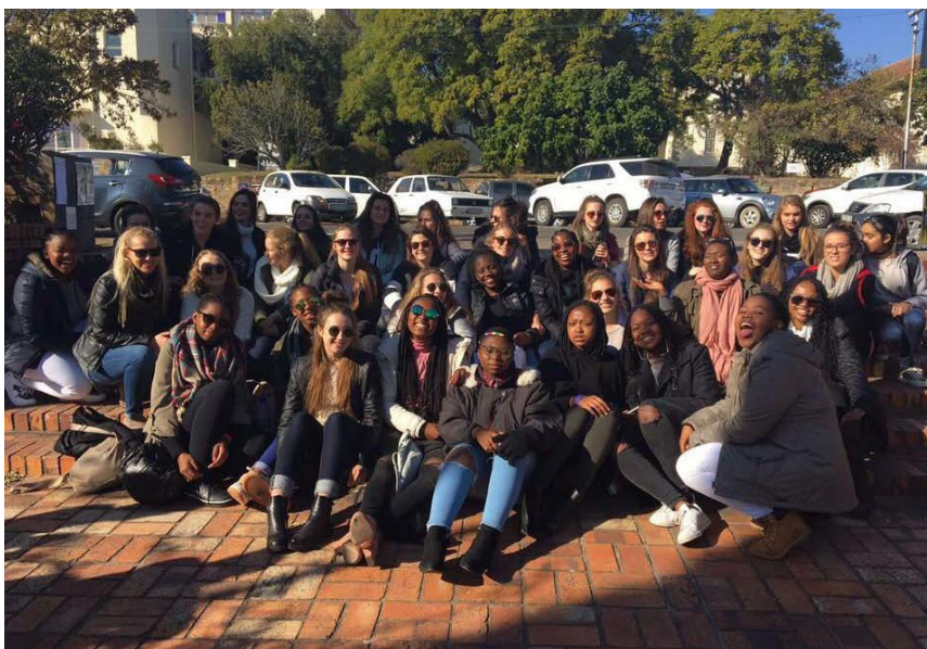
The group of St Mary's girls and staff members who went to the National Arts Festival in Grahamstown