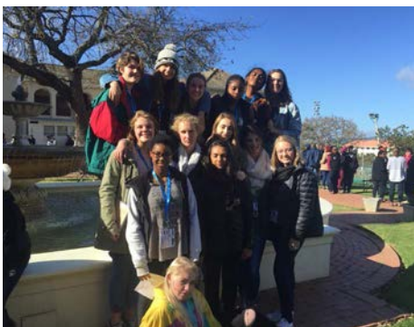
A band photo taken at the festival