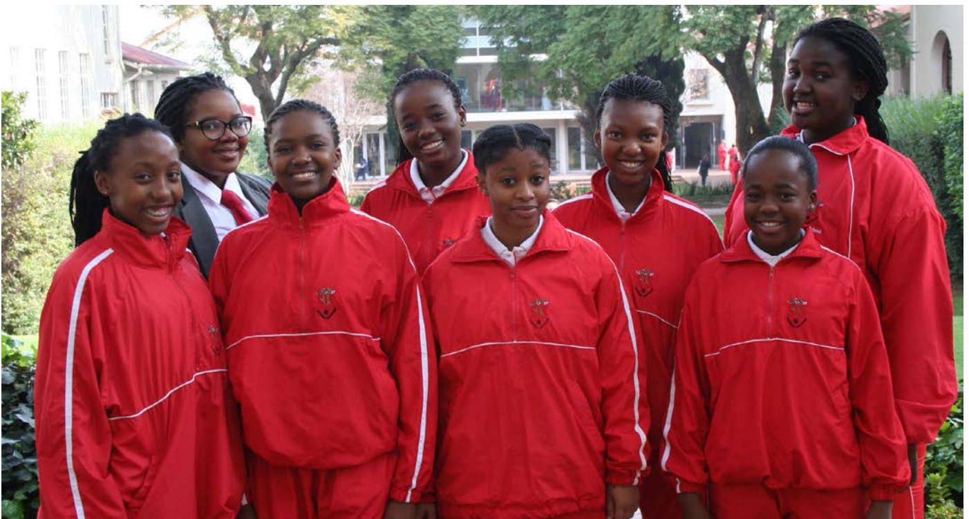
St Mary's Allan Gray scholarship girls