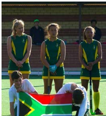
Georgina SA U16 B