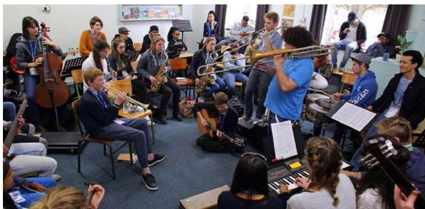
A festival workshop