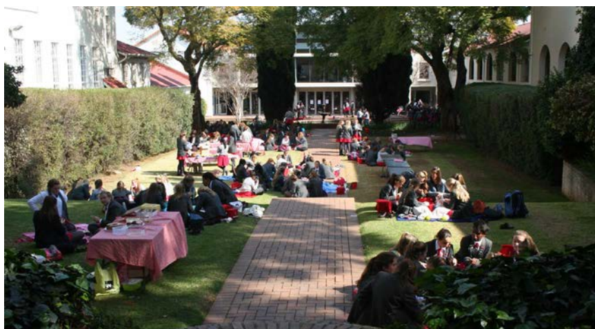
Celebrating Mandela Day by knitting squares for Warm The World