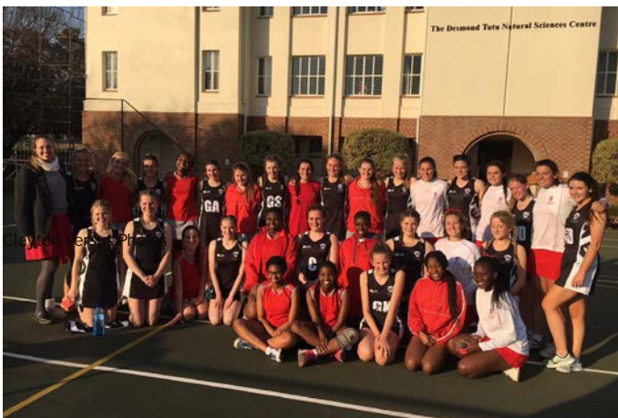
1 st and 2 nd team girls from Bloxham and St Mary's

On Thursday 14 July, St Mary's 1 st and 2 nd teams played against Bloxham from the United Kingdom. It was exciting to come up against a team we had not played before. Both teams played very well and we enjoyed meeting the Bloxham girls. The 1 st team won 29-7 and the Bloxham coaches and players were most complimentary about the performance. Our 2 nd team lost a very close game 15-11. It was an exciting game which could have gone either way and was enjoyed by all players.