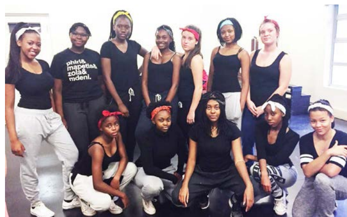
Hip hop dancers who performed in Andidedwa's dance

The dance crew created two new pieces to perform at the St Mary's Investec Hockey Festival.