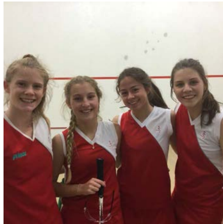
St Mary's B