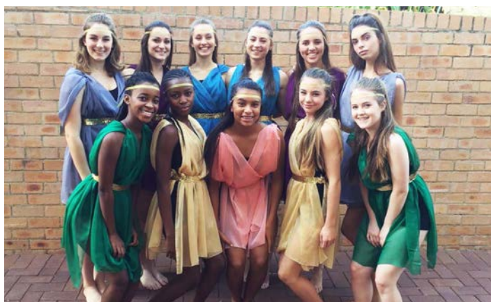
Contemporary dancers in Michela's dance