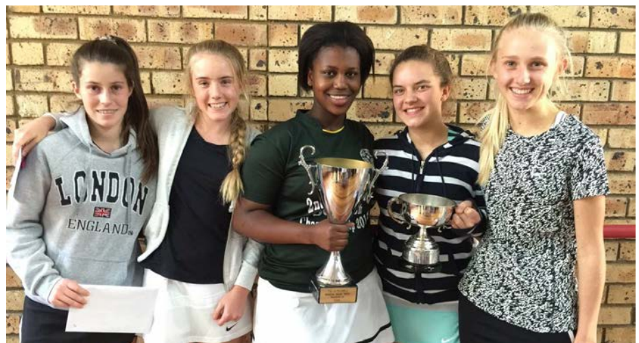
At prizegiving at Central Gauteng Junior Squash Closed

This past weekend, many of our St Mary's girls played in the Central Gauteng Junior Squash Closed Tournament, and the following girls have been chosen to represent their province at the Squash Inter-Provincial Tournaments during June.