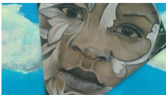
One of the panels