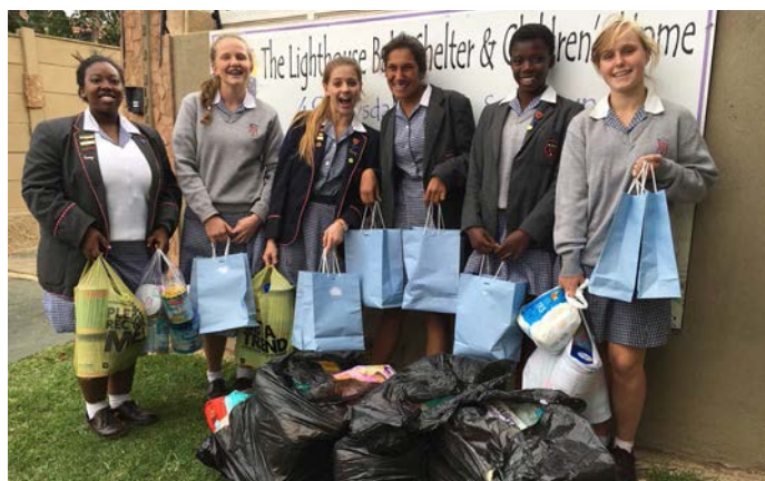
Outside the Lighthouse Baby Shelter and Children's Home