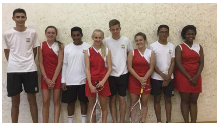
Jeppe Boys' High School with St Mary's

St Mary's U19 A beat Hoërskool Florida 11-3