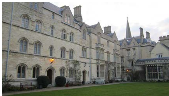
Our rooms were on staircase 10 in this beautiful building