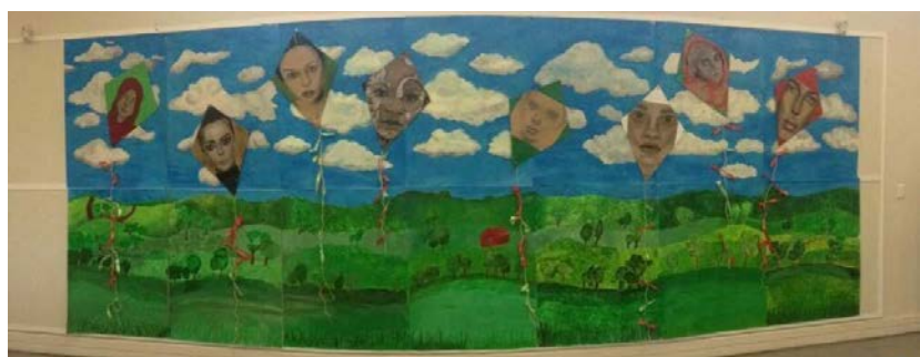
The final product

On Saturday 14 May, a group of St Mary's and Durban Girls' College girls participated in the first St Mary's Derby Day Art session. We undertook the ambitious task of painting a huge mural depicting rolling hills, trees and a sky filled with clouds. Each panel was painted by different girls and reflected their individual styles but, when assembled, formed one cohesive picture, symbolic of our two schools coming together. When assembled, kites made by Durban Girls' College pupils, depicting inspirational women, were placed on the mural to encompass our theme of "Girls Flying High". Although we were all happy with the end result, the best part was definitely getting to know some new faces and bonding with some old ones in a creative space.