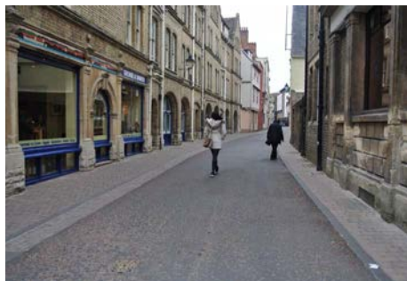
A typical cobbled street in Oxford