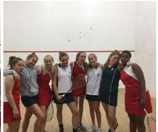
St Mary's A with Durban Girls' College