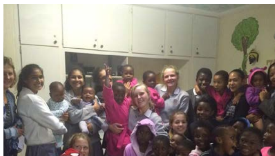
At the baby shelter