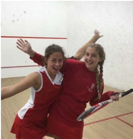
Having a bit of fun after the match against Durban Girls' College

St Mary's entered A and B teams in the Derby Day. The girls played exceptionally well, winning every match and not dropping one game.