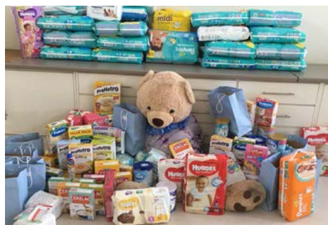
The donations of baby products