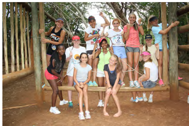
A group of girls pleased about getting their entire team through the giant spider web without touching the sides