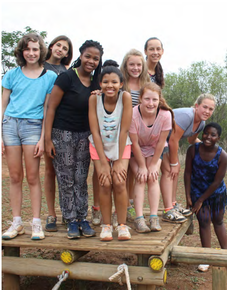
Success at the end of a tricky team challenge