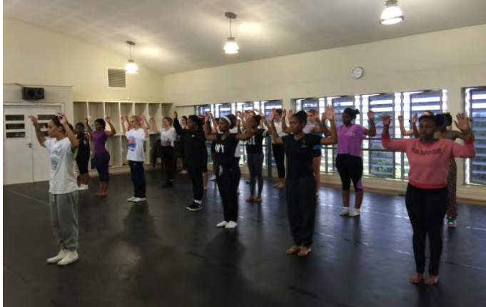
In the dance studio

We offer modern dance, latin and hip hop classes.