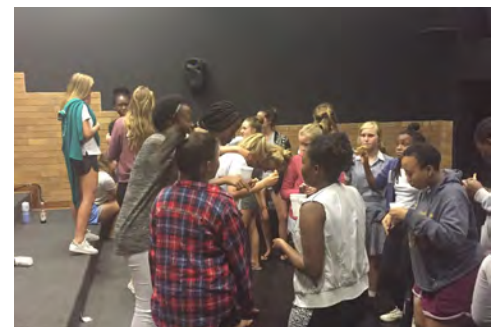
Drama girls having fun