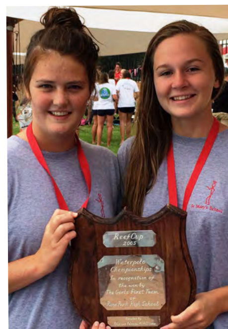
Water polo captains - Reef Cup trophy