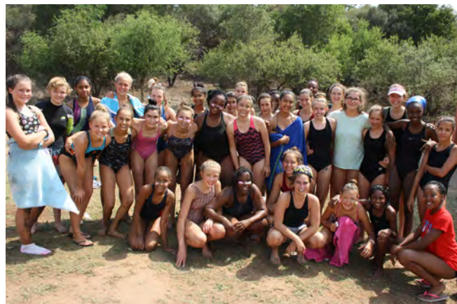
Girls relieved at completing the challenging obstacle course