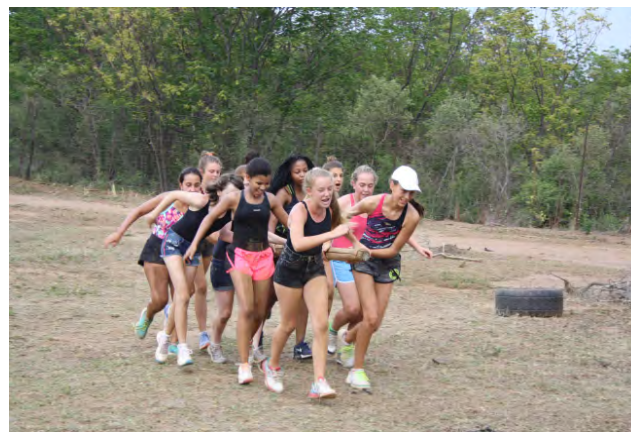
Working as a team