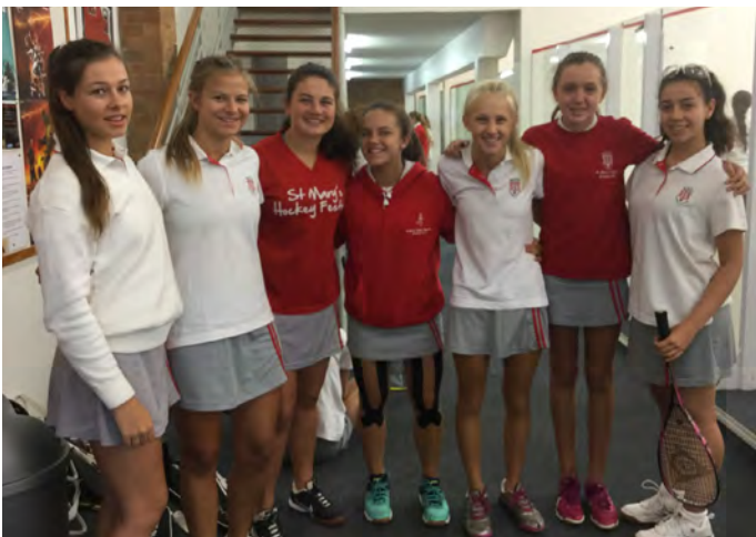
St Mary's Championships