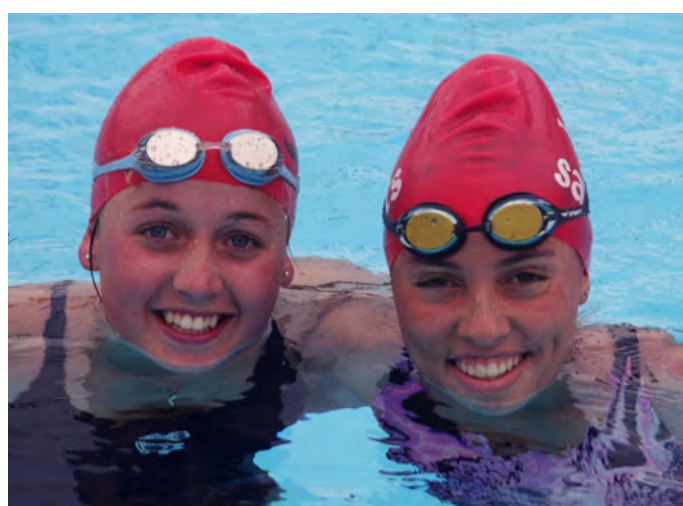
Training during the holidays