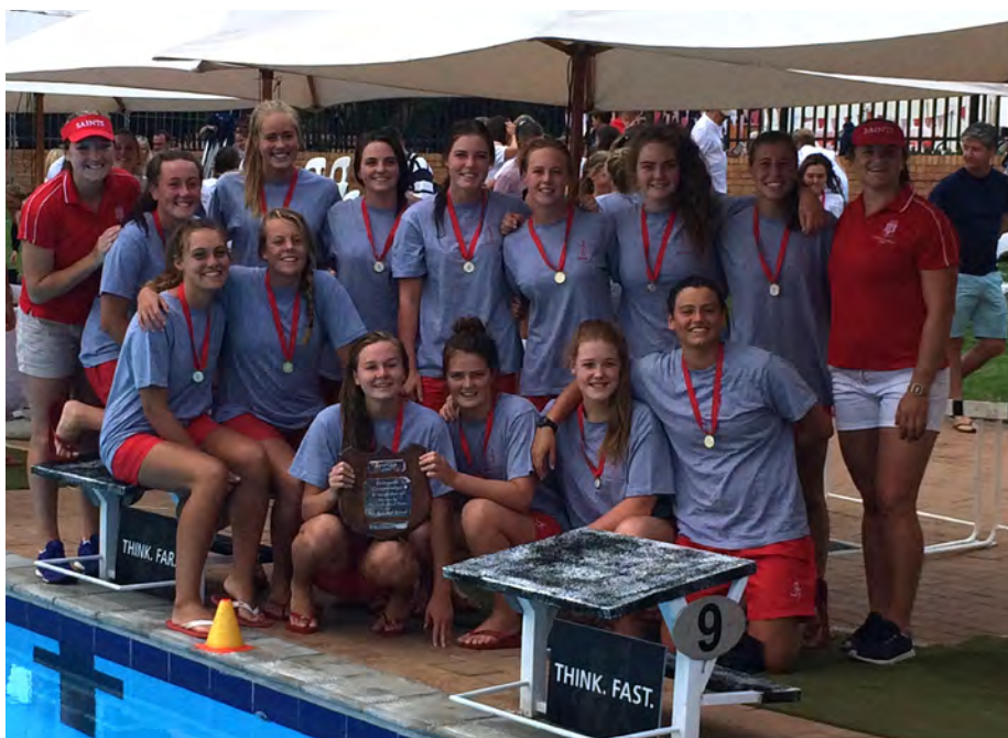
Reef Cup winners